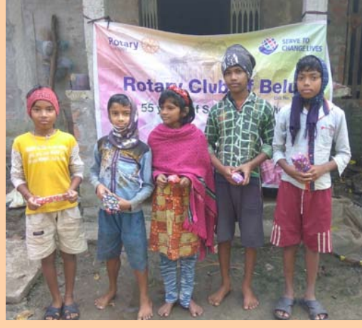
Celebration with children on 14th November:

We wanted to learn how the flooded area at East Midnapore is doing now, This is the area where we reached with help in the last week of September.