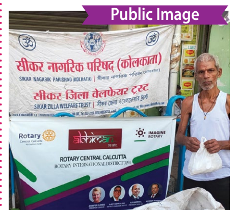
Health & Nutrition