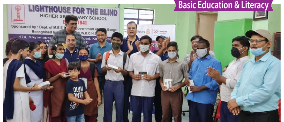
Basic Education & Literacy