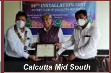
Calcutta Mid South