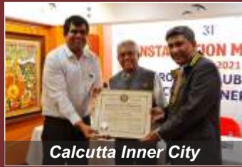
Calcutta Inner City