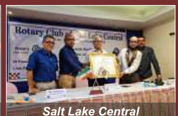
Salt Lake Central