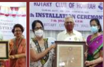
Calcutta Sun City