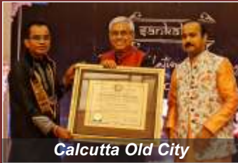
Calcutta Old City