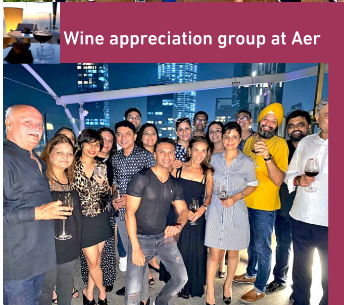
Wine appreciation group at Aer