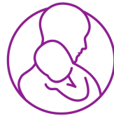
MATERNAL AND CHILD HEALTH