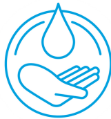
WATER, SANITATION, AND HYGIENE