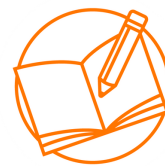
BASIC EDUCATION AND LITERACY