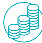
COMMUNITY ECONOMIC DEVELOPMENT