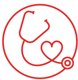
DISEASE PREVENTION AND TREATMENT