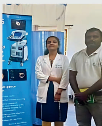
D 3170 — RC Hubli Central