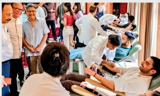
D 3080 — RC Chandigarh Mid Town