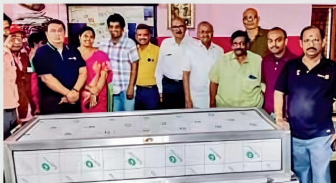
D 3020 — RC Visakhapatnam