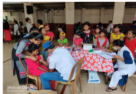
Free Blood Test at Uposhom on 24 th July 2022