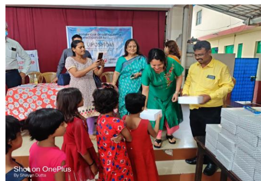
Food Packets Distribution at Uposhom on 24 th July 2022