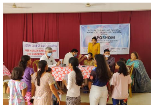
Uposhom – Free Health Check Up Camp on 24 th July 2022