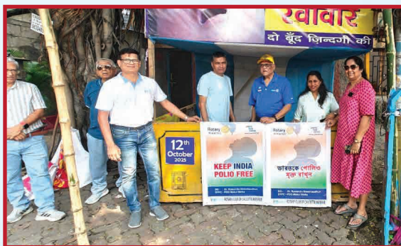
Announcements were being made to create awareness for SNID at Mustafapur. This refers to a specific day when health organizations immunize children under a certain age against diseases like polio and others. Polio drops at Mustafapur