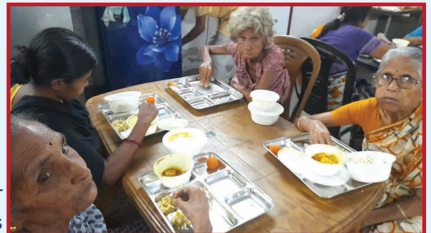
Venue: Ghare Phera for 40 homeless individuals find refuge here each night. Among them, 15 elderly residents, unable to work, are provided with two meals daily. The others receive a subsidized lunch of rice and egg from the government-run Maa Canteen for