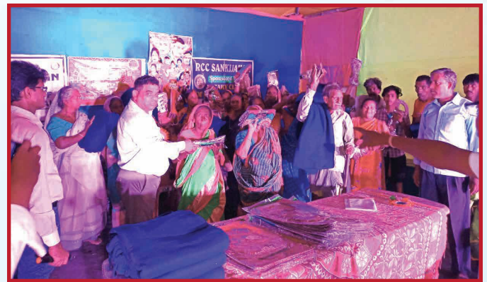
Venue: RCC SANKIJAHAN Distributed blanket to 60 villagers