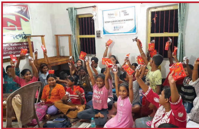
Venue: Manan Khardah Coaching centre Gurukul Classes, Maths and singing for 30 students of Class II to IX and served Snack Chocolate and Cake