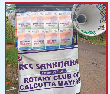
Announcements were made explaining the importance of vaccines at Sankijahan, Kultali, Sunderbans