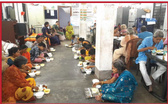
Venue: Mandirtala Night Shelter & Shelter at Howrah Shibpur for 80 beneficiaries