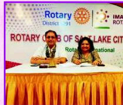
RWM in progress