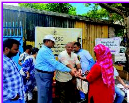
Mother & Child Project 17th July 2022