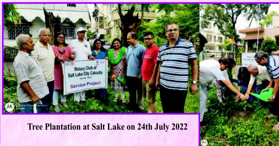
Tree Plantation at Salt Lake on 24th July 2022