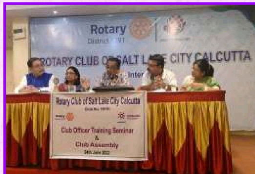
Club Officers Training Seminar & Club Assembly