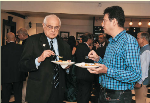
Two Metropolitans Past President exchanging the views