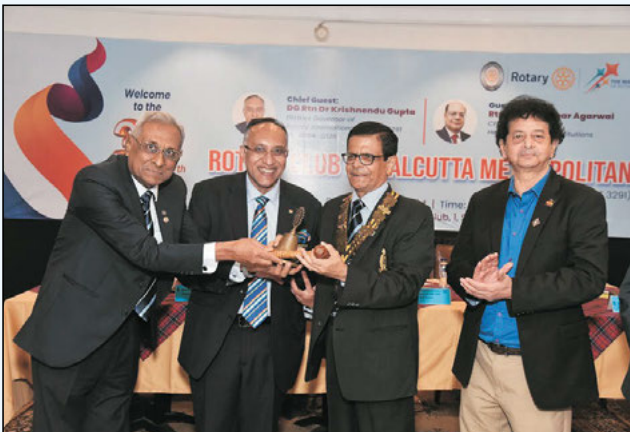
IPP Handing over Bell and Gravel