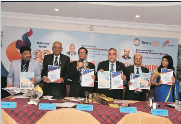
Finally release of Metro Voice and Spl Activity reports for RY-2023-2024