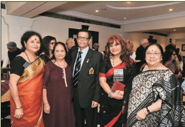
President with Fellow Rotarians