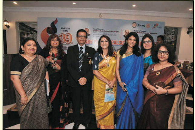
President with Fellow Rotarians of other Clubs