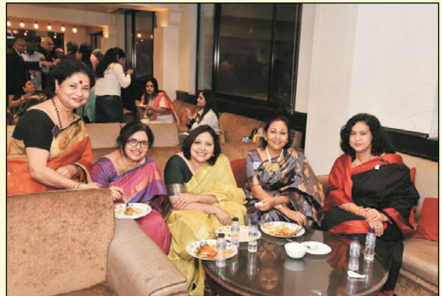
Fellow Rotarians enjoying the fellowship