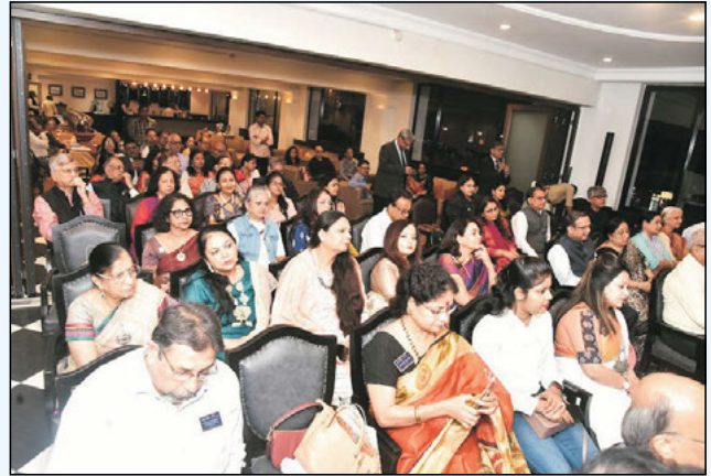
Another view of audience