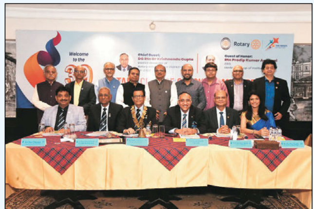
Memorable Snap with PDGs of RID-3291