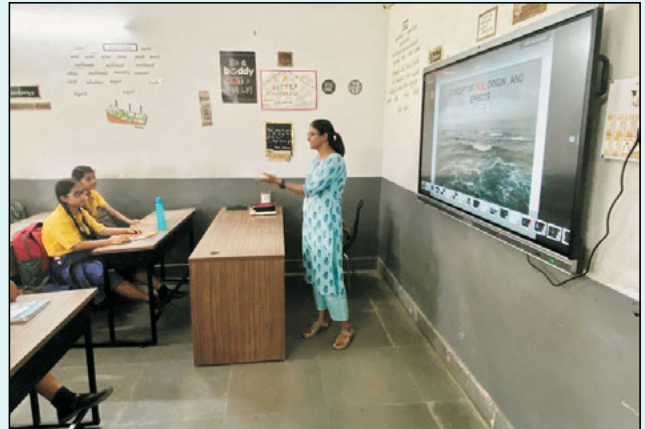
Teacher taking classes through Smart Board