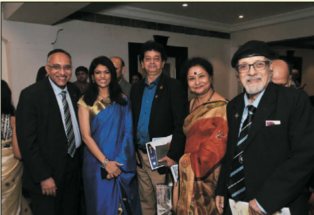
DG, DGE and others