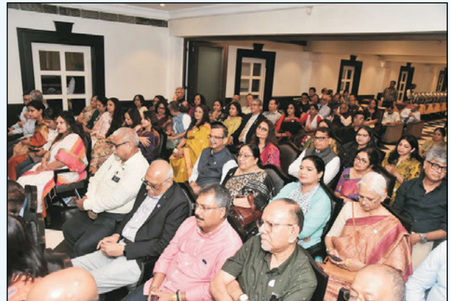
Audience enjoying the proceedings