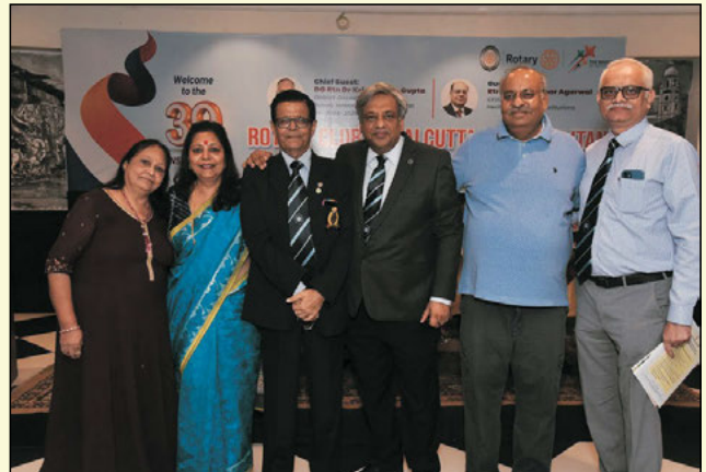
Metropolitans with First Lady of the Club