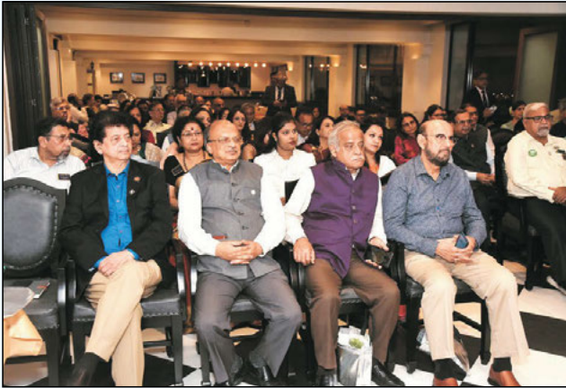
A view of audience