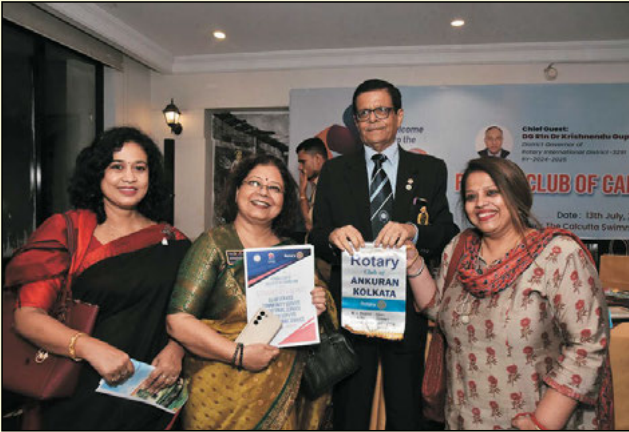
Exchange of Flags