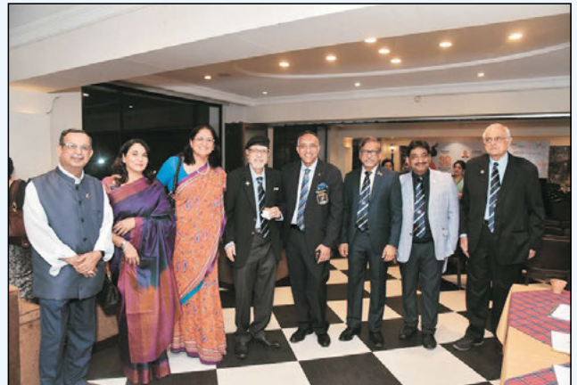
DG with Metropolitans and other Rotarians