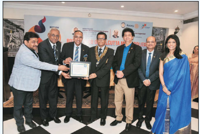
IPP handing over the Charter of the Club to the President in presence of DG, DGE and DGN