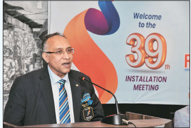
Another view of DG