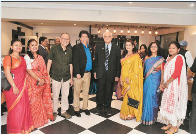
DG, DGE with teachers of PACE Learning Centre and others