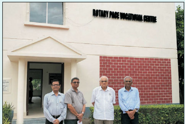
Visiting Rotary PACE Learning Centre