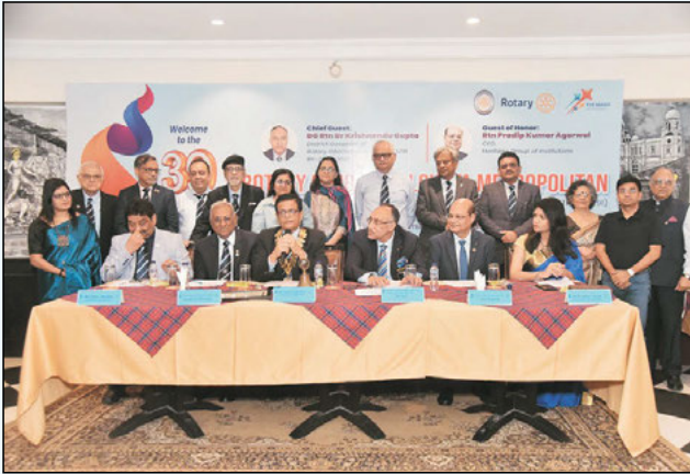
A view of Board for RY-2024-2025