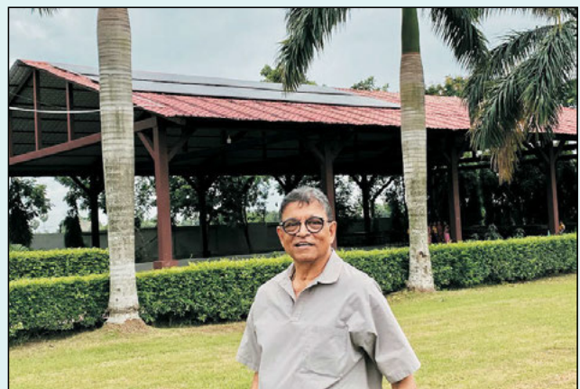
A view of Solar Plant