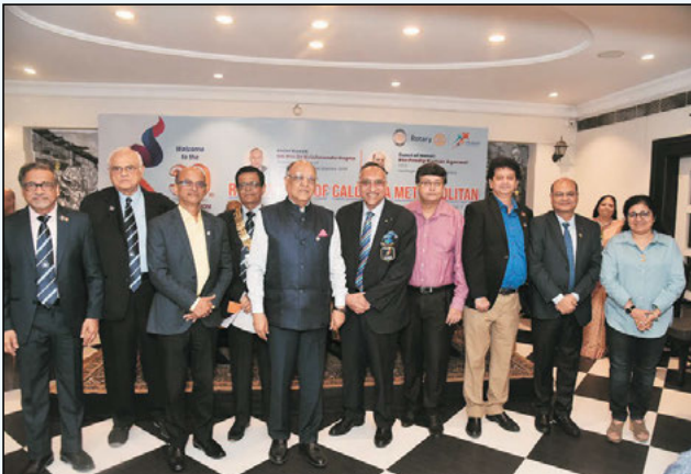
Metropolitans contributing USD 100 for Polio Plus Society