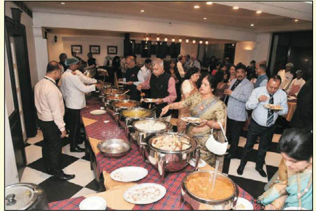
Another view rotarians enjoying dinner