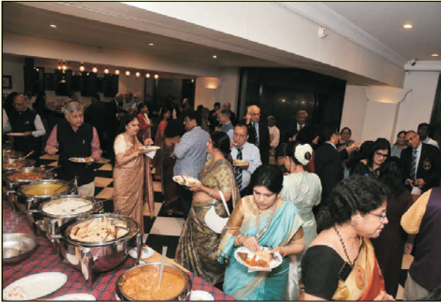
A view of rotarians enjoying dinner