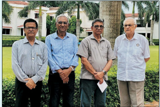
PP RC Singapore visiting PACE Learning Centre