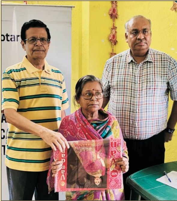
DISTRIBUTION OF SAREES TO WIDOWER AND SENIOR CITIZENS