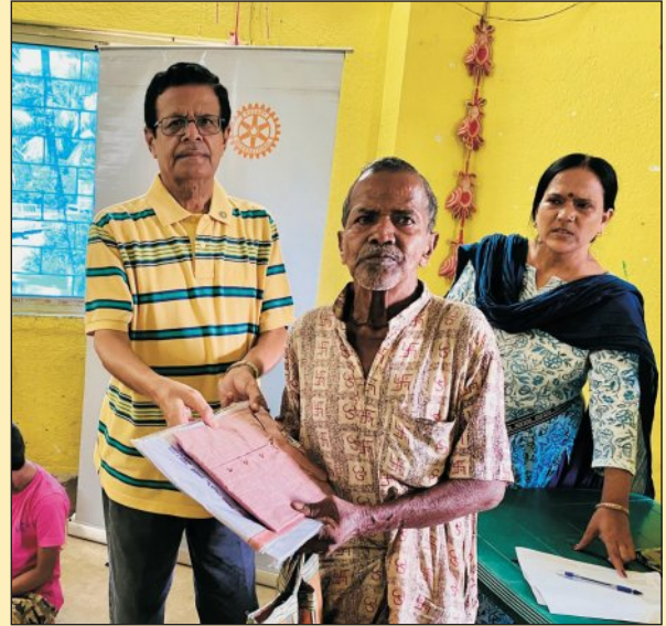
DISTRIBUTION OF NEW CLOTHES TO BACK-OFFICE STAFF