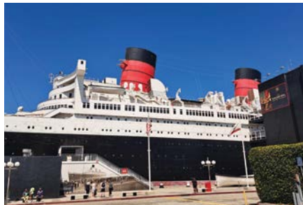
At the Long Beach Rotary Club in California