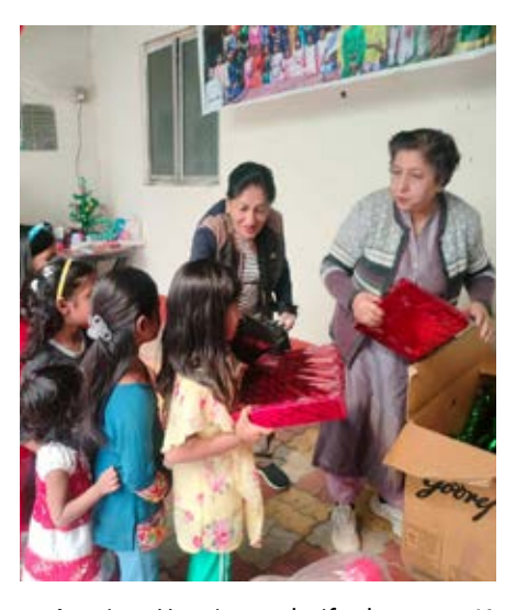
to Arunima Hospice and gifted toys to 60 children, spreading cheer and joy. Food packets