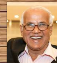
Rtn. Vasant Kakodkar Fellowship