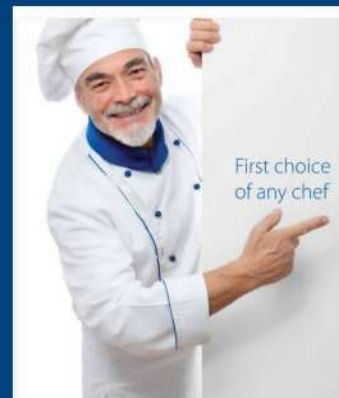
First choice of any chef