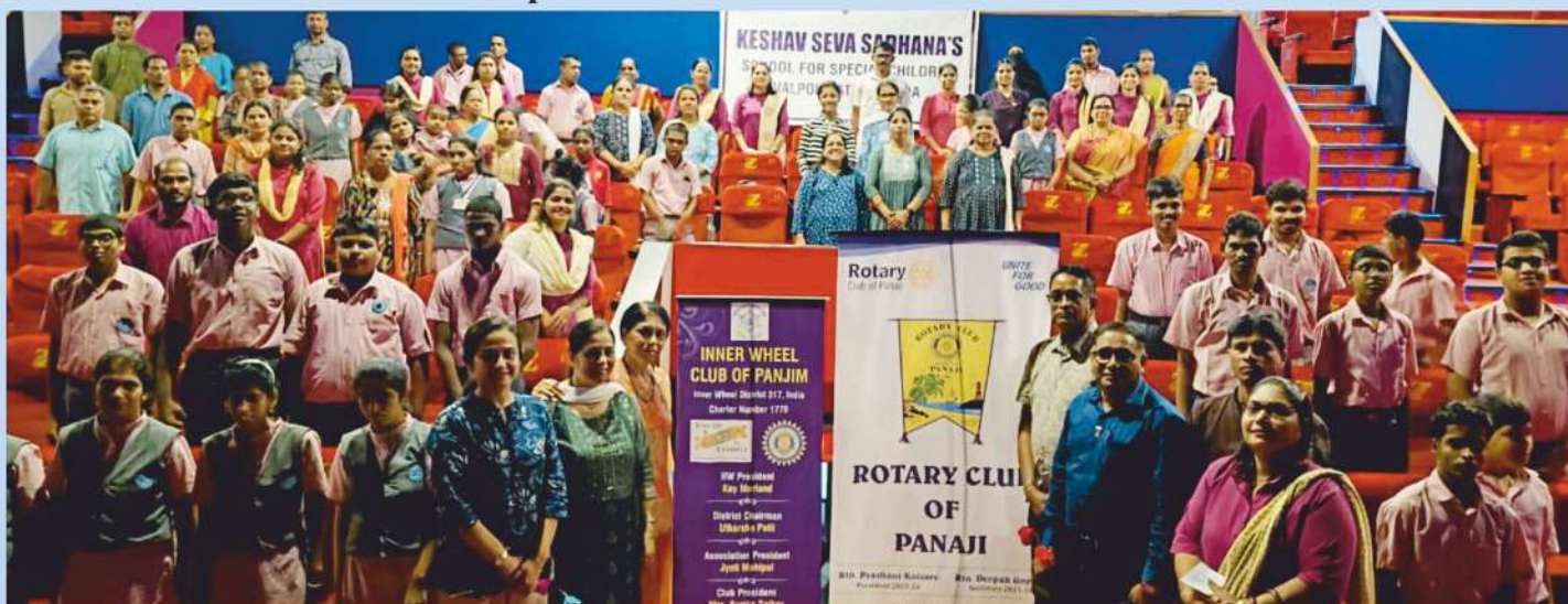
Movie Screening for Special Children -Sitare Zameen Par