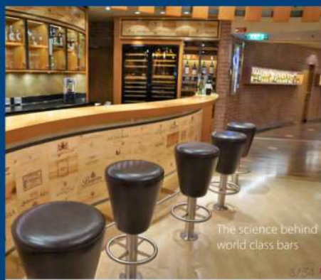
The science behind world class bars

For your Commercial Kitchens, Bars, Bakery, Banquets & QSR : Designing, Manufacturing, Commissioning & After Sales Service Back ups Under One Roof. "STAR OPUS"