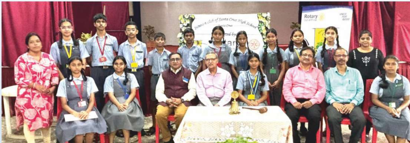
Interact Club Installation - Santa Cruz High School