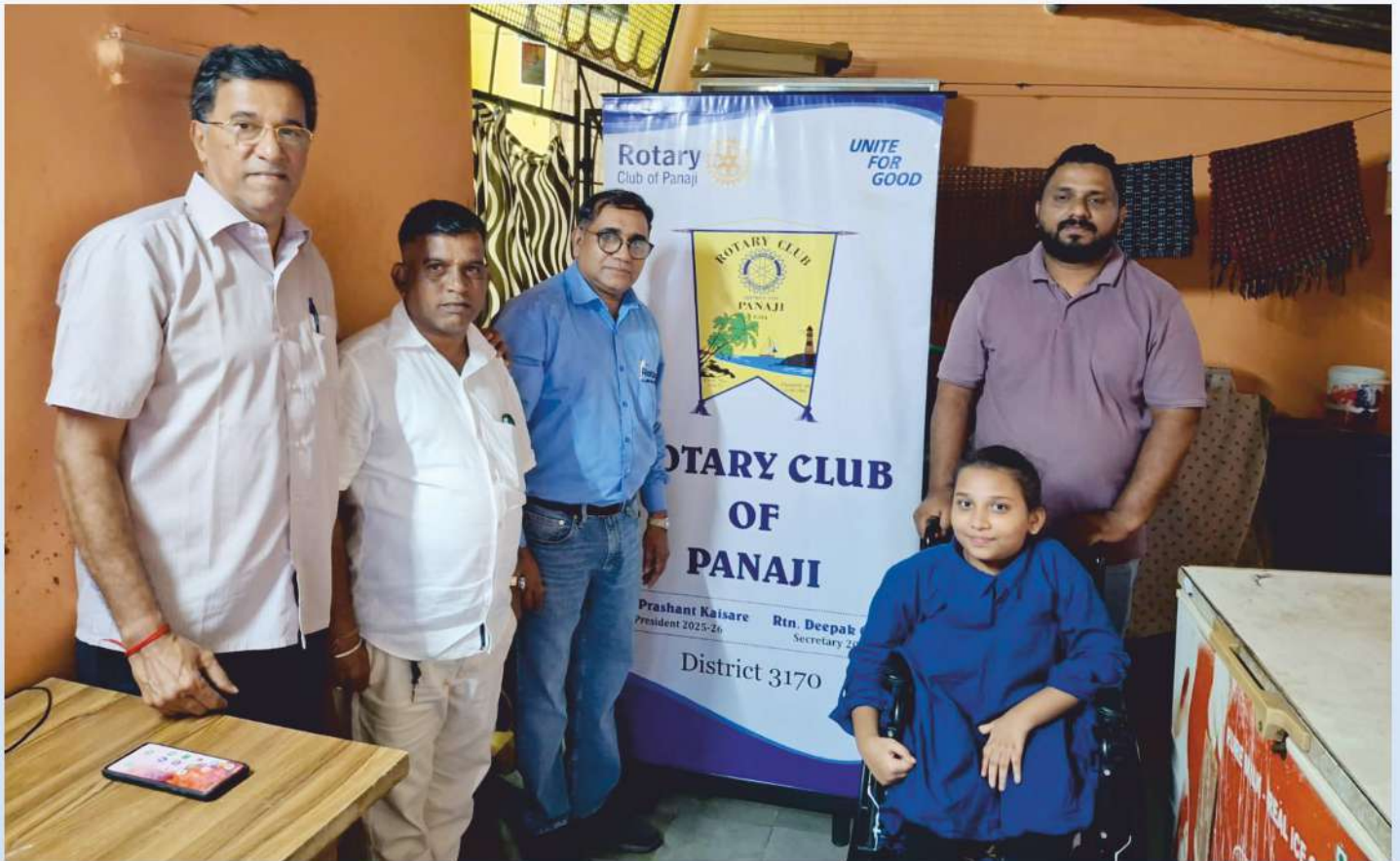
Wheel Chair donated to the needy child