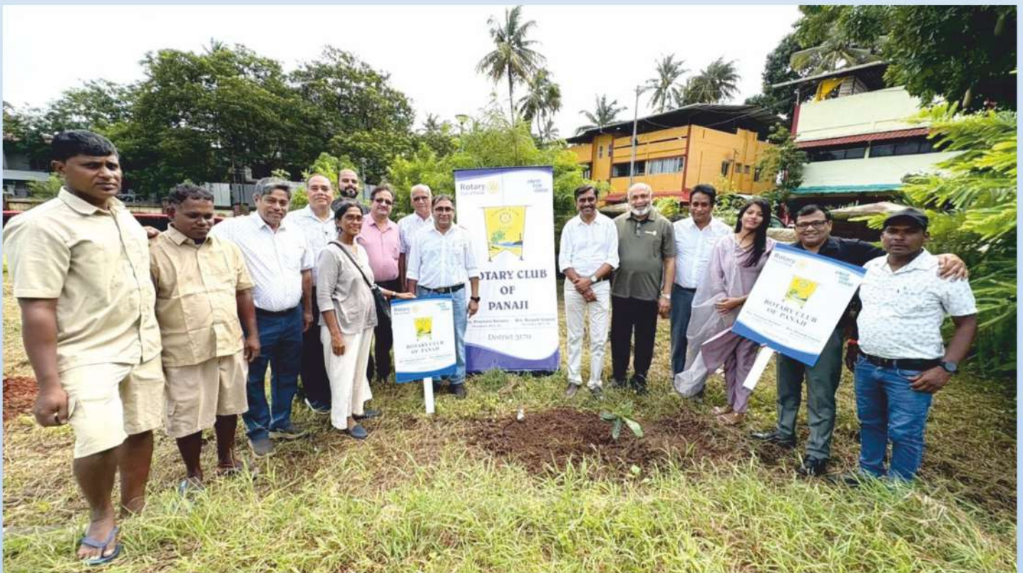
Tree Plantation Drives at Various Locations