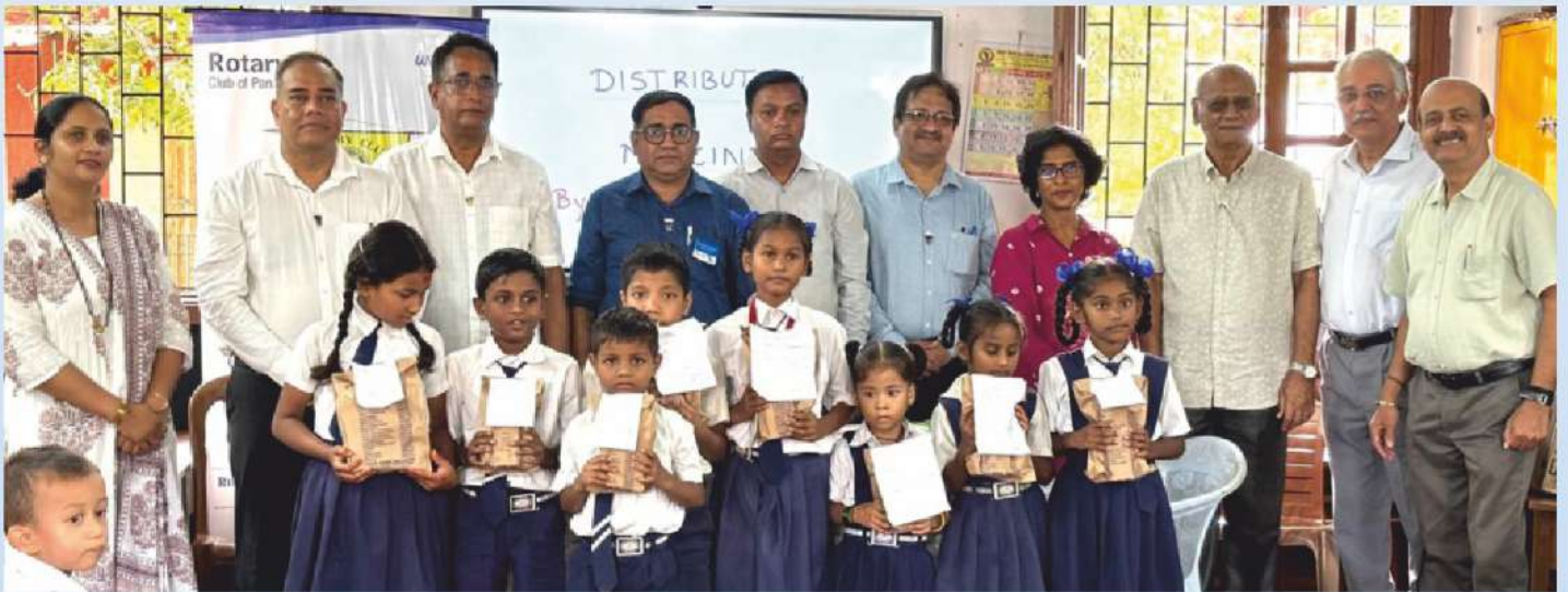
Pediatric Health Camp and Distribution of Medicine - Government Primary School, Chincholem & Taleigao