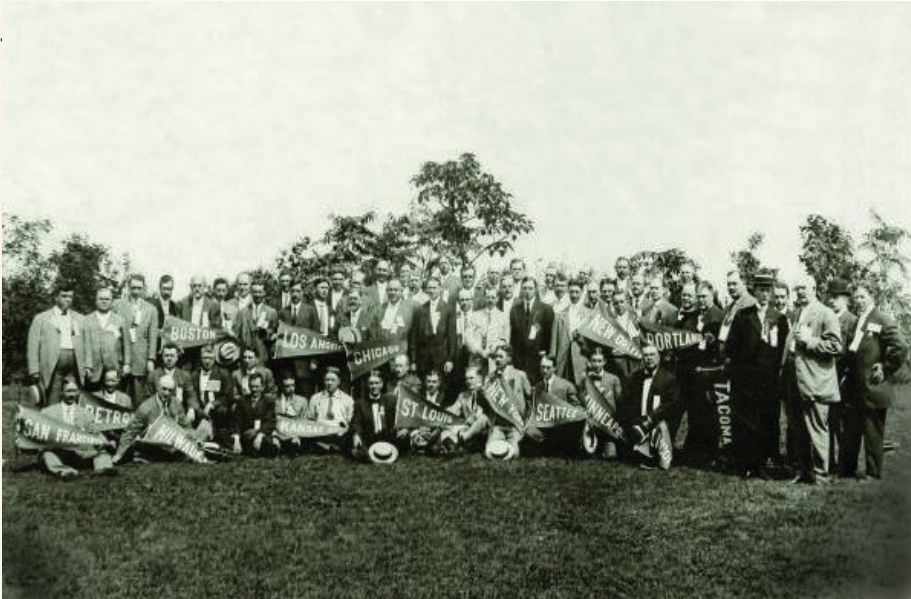
Attendees at Rotary's first convention in Chicago in 1910. Rotary's first fiscal year began the day after the convention ended.

The executive committee agreed and, in April 1913, designated 30 June as the end of the fiscal year. This also allowed for changes to the schedule for reporting club membership and payments. Even The Rotarian changed its volume numbering system to correspond to the fiscal year (beginning with Volume 5, No. 1, in