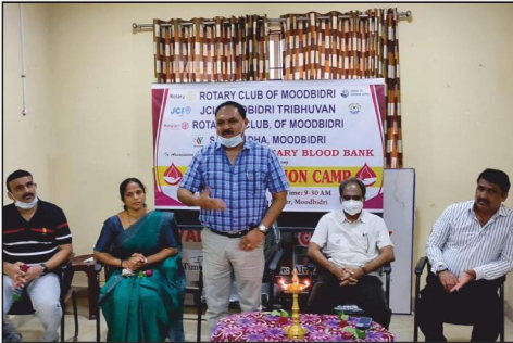
Inauguration of Blood donation camp