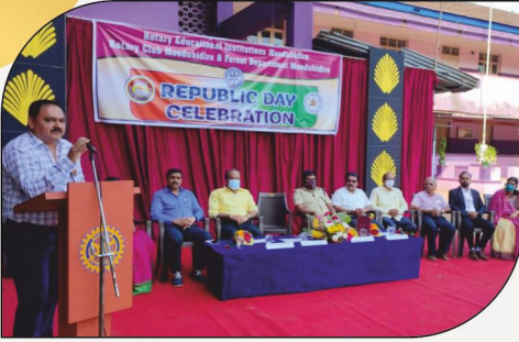
Republic Day Celebration at Rotary Eng.Med.School