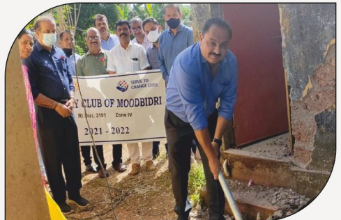
Foundation stone laying program at Masthikatte School