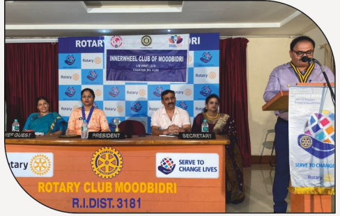
Joint Meeting with Inner Wheel Club