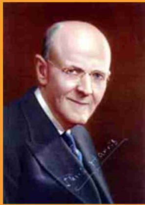
Rtn. Paul Harris Founder of Rotary