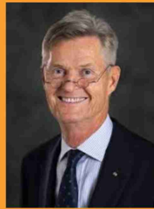
Rtn Holger Knaack R I President 2020-21