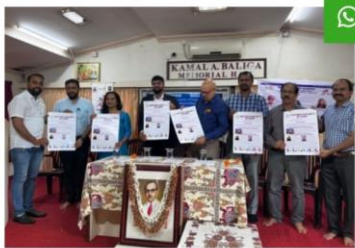
ಉಡುಪಿ : Autism Society of Udupi, ಡಾ. ಎ.ವಿ. ಬಾಲಿಗಾ ಸ್ಮಾರಕ ಆಸ್ಪತ್ರೆ, ರೋಟರಿ ಕ್ಲಬ್ ಉಡುಪಿ, ಮತ್ತು ರೋಟರಿ ಕ್ಲಬ್

written by NewsDesk | September 29, 2024