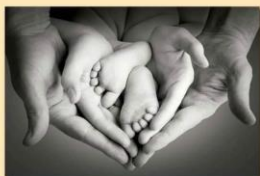
Celebrating those that give life and future to the next generation.