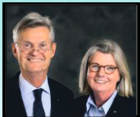
RI President Couple

Dear Rotarians, Rotractors, and friends,