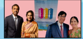
District Governor & President Couple

It is indeed a great pleasure to me that our fellow Rotarians have encouraged and elevated me to the position of President of Rotary Bangalore Ulsoor for the Rotary Year 2020-2021.