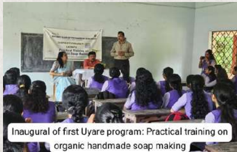
Inaugural of first Uyare program: Practical training on organic handmade soap making