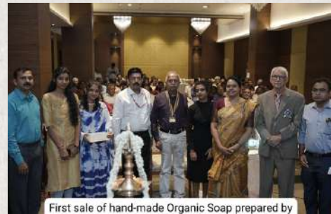
First sale of hand-made Organic Soap prepared by