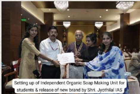
Setting up of Independent Organic Soap Making Unit for students & release of new brand by Shri. Jyothilal IAS