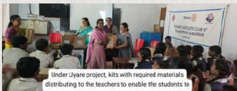
Under Uyare project, kits with required materials distributing to the teachers to enable the students to