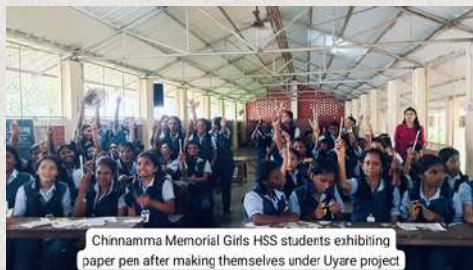
Chinnamma Memorial Girls HSS students exhibiting paper pen after making themselves under Uyare project