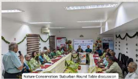
Nature Conservation: Suburban Round Table discussion