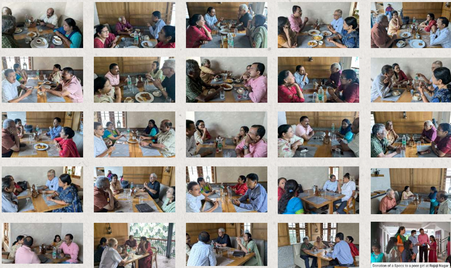
Donation of a Specs to a poor girl at Rajaji Nagar