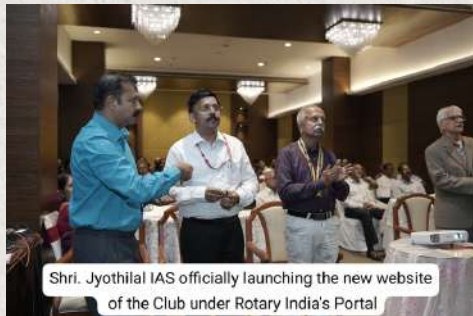
Shri. Jyothilal IAS officially launching the new website of the Club under Rotary India's Portal