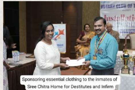
Sponsoring essential clothing to the inmates of Sree Chitra Home for Destitutes and Infirm