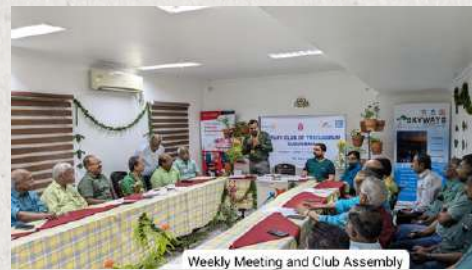
Weekly Meeting and Club Assembly