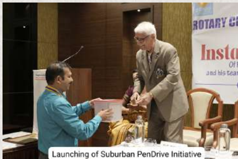
Launching of Suburban PenDrive Initiative