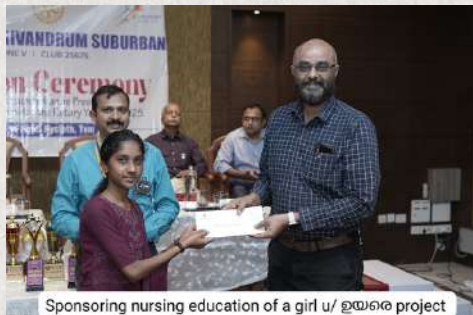
Sponsoring nursing education of a girl u/ @ayara project