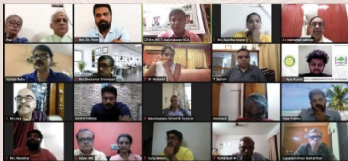
Well attended Joint Board Meeting