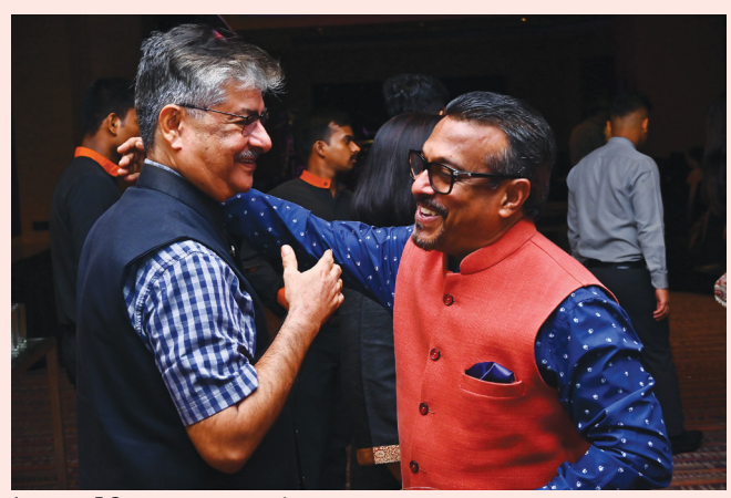
Issue 10: Best Captions