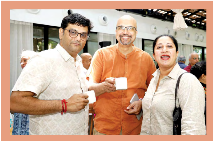
Issue 17: Best Captions