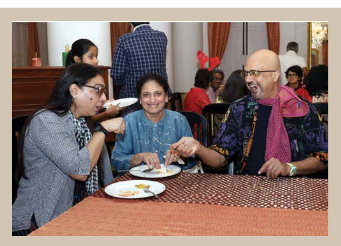
Issue 23: Best Captions