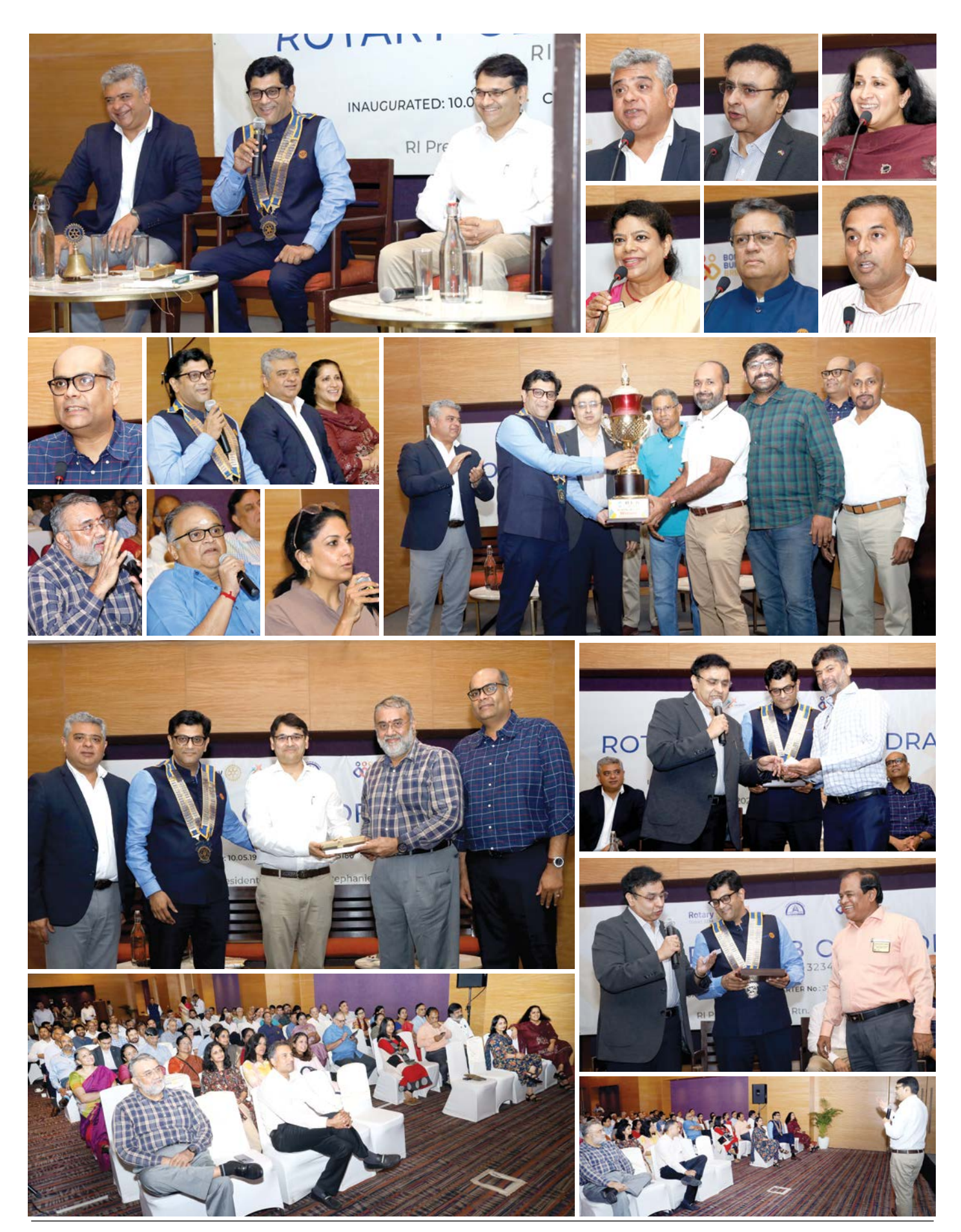
The Lighthouse | 15 December 2024