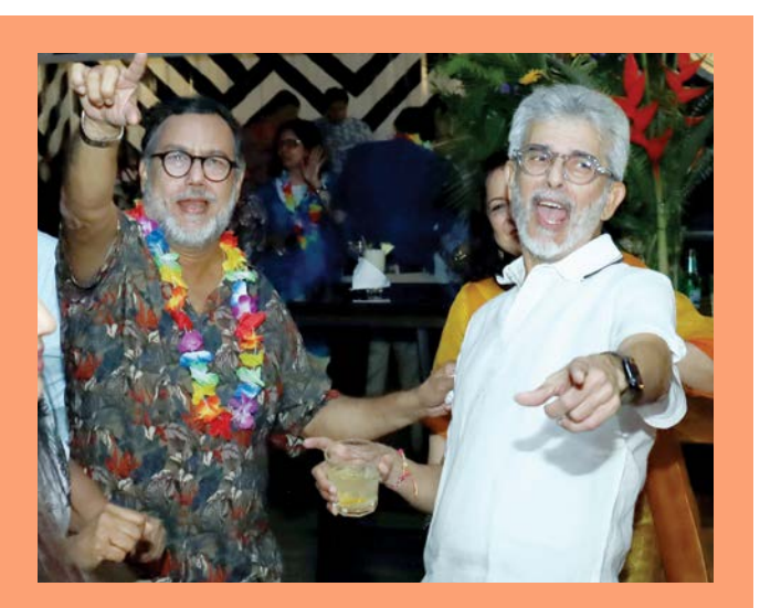
Issue 26: Best Captions