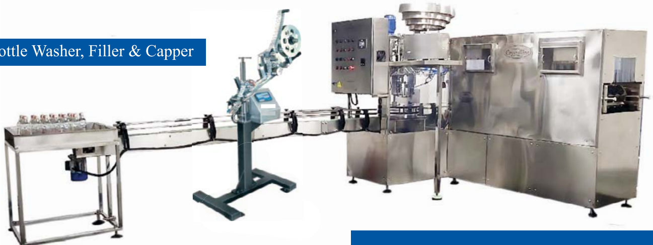
Bottle Washer, Filler & Capper