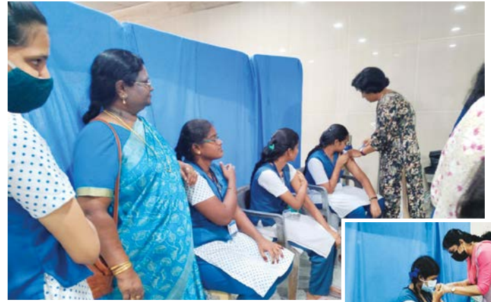
(This event is part of a series of ongoing initiatives to promote HPV vaccination.)

The Rotary Club of Madras, in partnership with Adyar Cancer Institute, launched an initiative to provide cervical cancer vaccinations to girl children in July 2024. As part of this endeavor, the 8th vaccination drive was held on December 26, 2024, for the children of Sir Sivaswami Kalalaya Matriculation Higher Secondary School, Mylapore, Chennai.