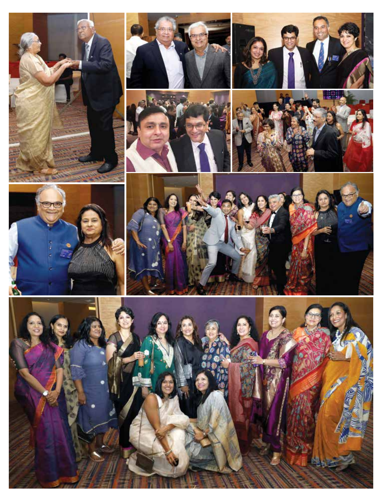
The Lighthouse | 21 July 2024