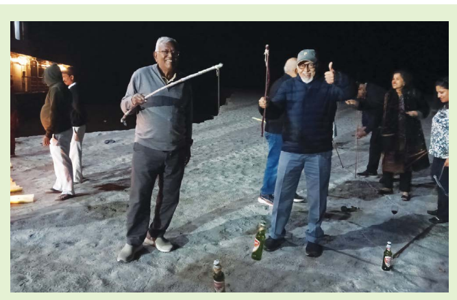
Issue 46: Best Captions