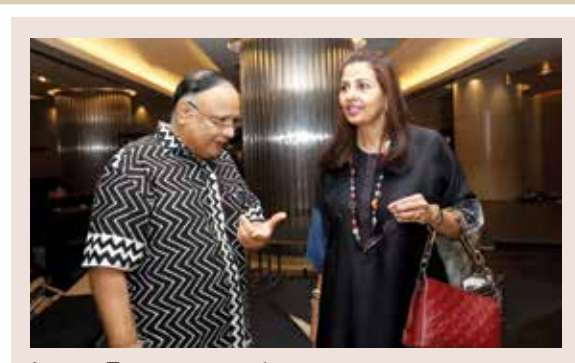
Issue 3: Best Captions