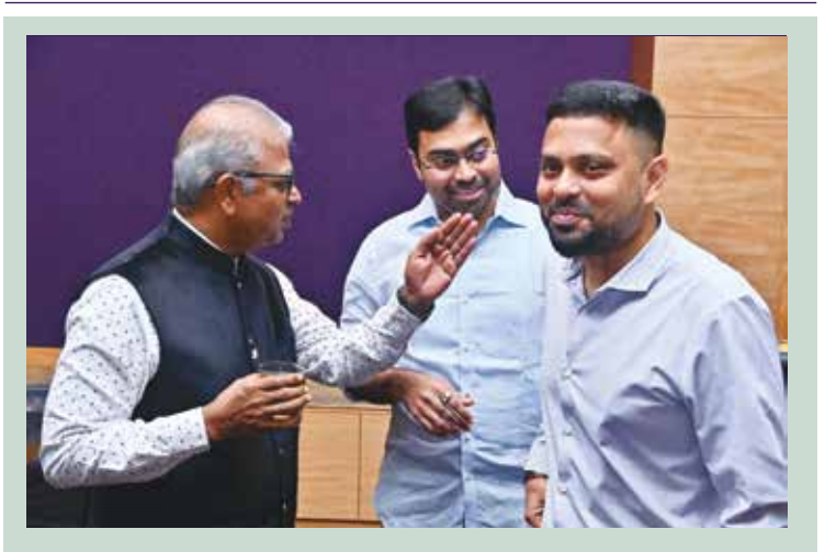
Issue 6: Best Captions