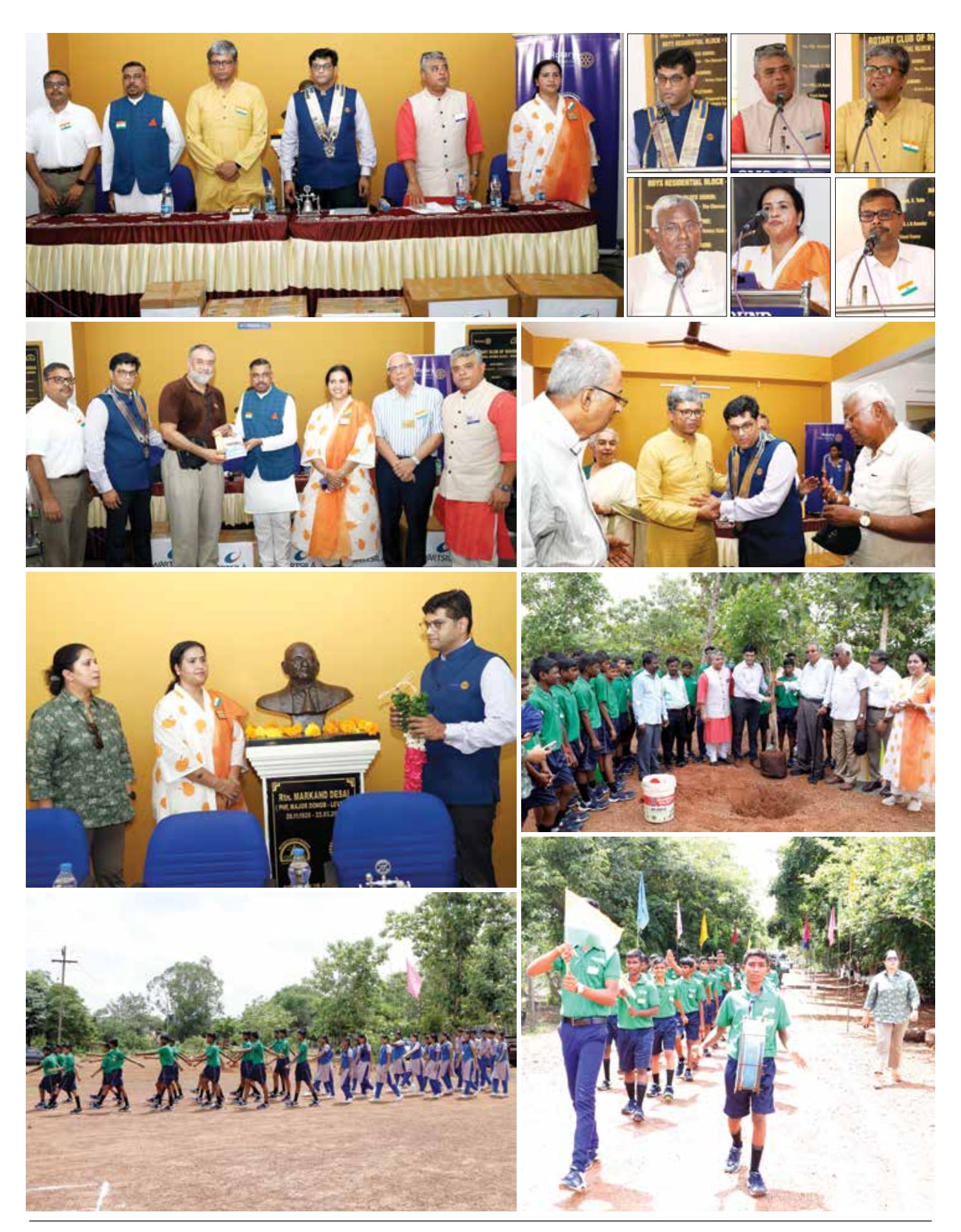
The Lighthouse | 18 August 2024