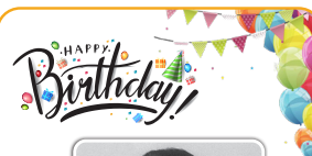
Rtanne. Sudesh Wadhwa 30th September