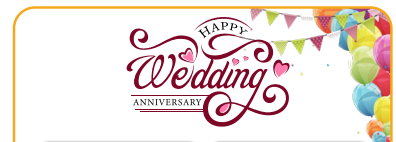
Rtn. Pradip Bahl & Rtanne. Anshu Bahl 30th September