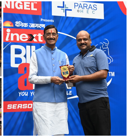
Dainik Jagran iNext Bikeathon