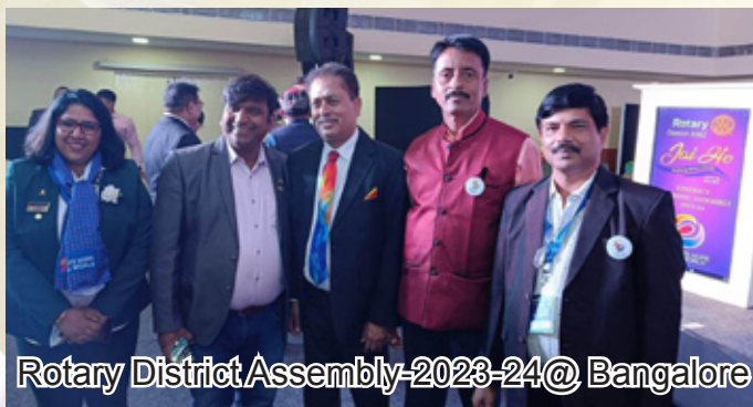
Rotary District Assembly-2023-24@ Bangalore