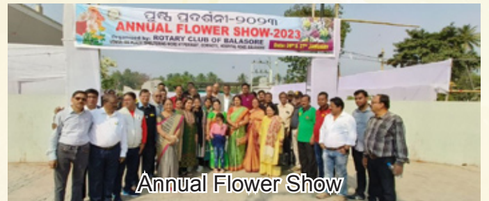
Annual Flower Show