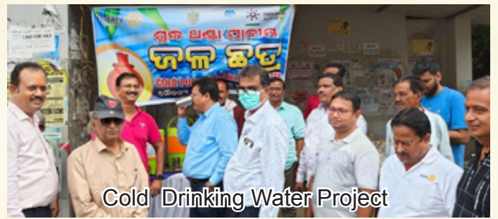
Cold Drinking Water Project