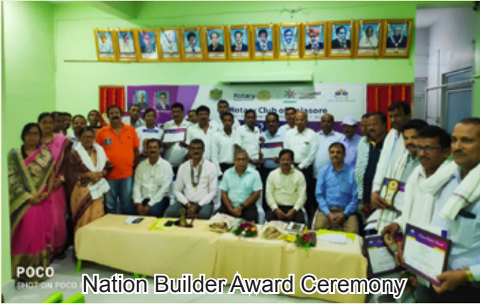
Nation Builder Award Ceremony