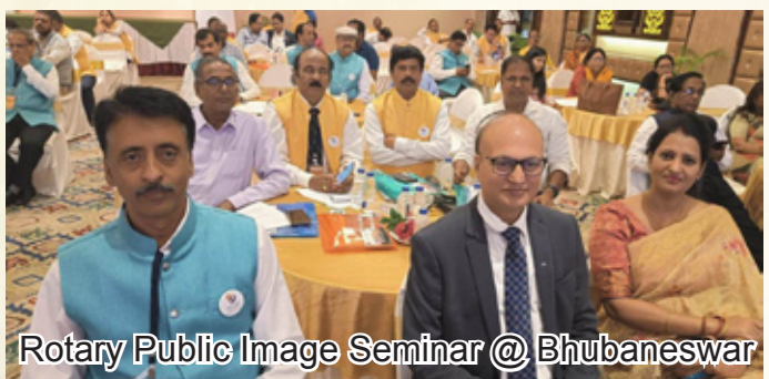
Rotary Public Image Seminar @ Bhubaneswar