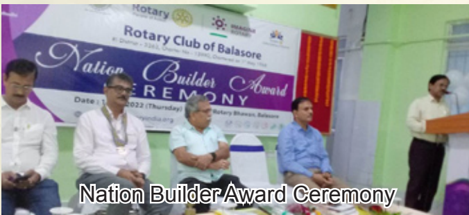
Nation Builder Award Ceremony