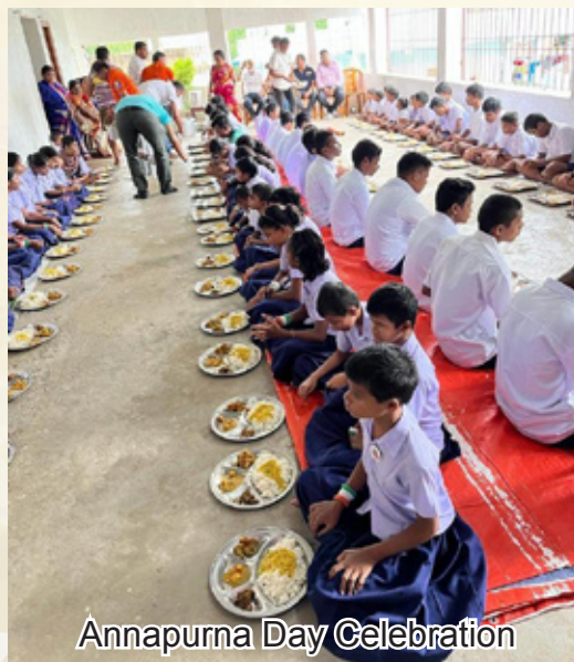
Annapurna Day Celebration