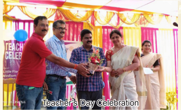
Teacher's Day Celebration