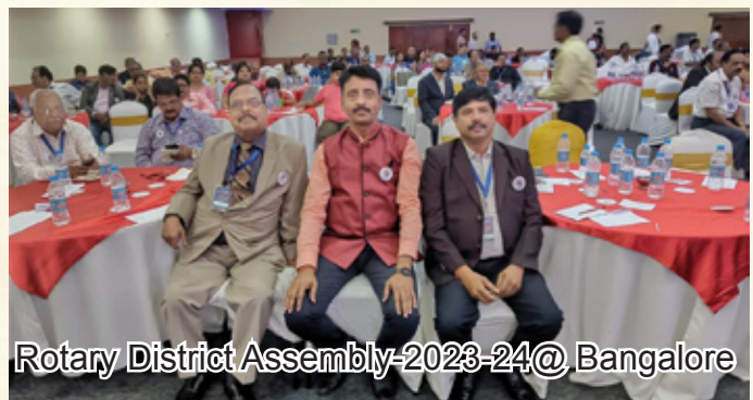
Rotary District Assembly-2023-24@ Bangalore