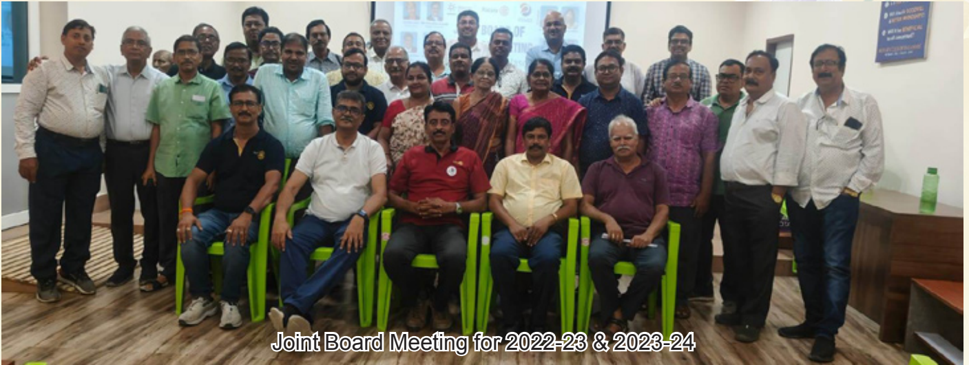
Joint Board Meeting for 2022-23 & 2023-24