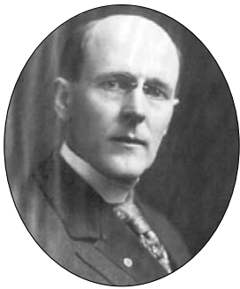
PAUL PERCEVAL HARRIS