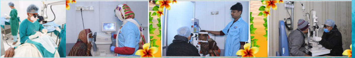
Rotary Balasore Eye & Dental Clinic