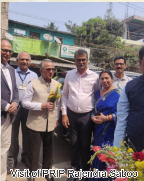
Visit of PRIP Rajendra Saboo