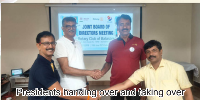
Presidents handing over and taking over