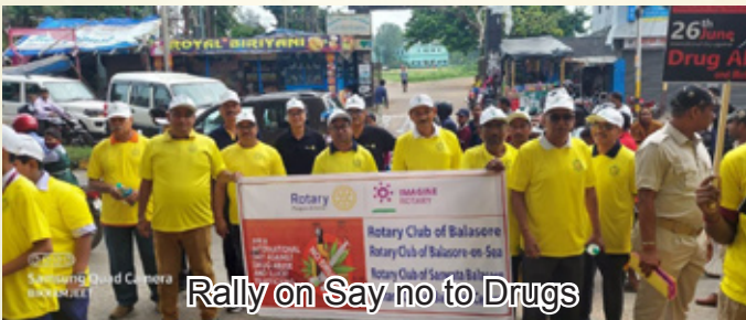
Rally on Say no to Drugs