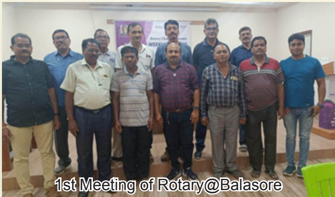
1st Meeting of Rotary@Balasore