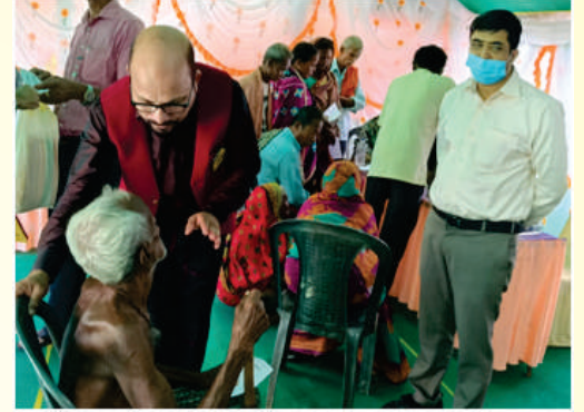
Club meeting 08.11.2024