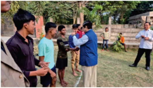
Muruja competition among inmates of Short Stay Home, Bidanasi. & Prizes given by Rotarians of Cuttack Midtown