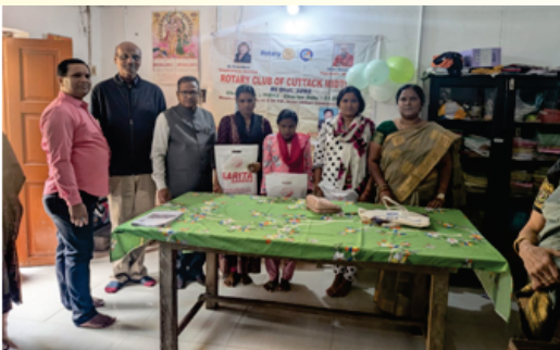
Art Competition on Nature Nurtures & prizes giving ceremony at Sarada Sikhyaniketan, Bangalisahi, Cuttack by R. C. Of Cuttack Midtown