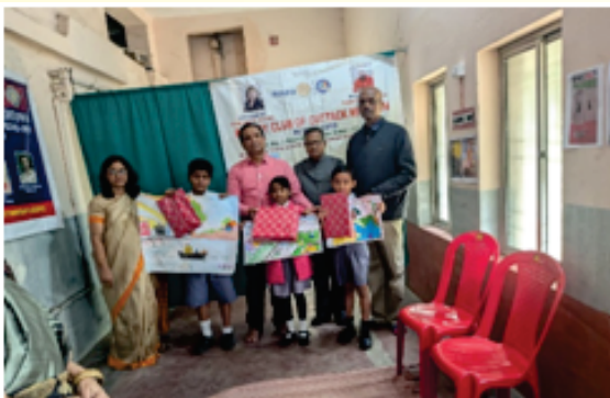
Free dental check up camp at Heritage Hospital & 5th programme Volley Ball exhibition match between Rotary Gp vs Neherupalli Nodal School Teachers & old students.