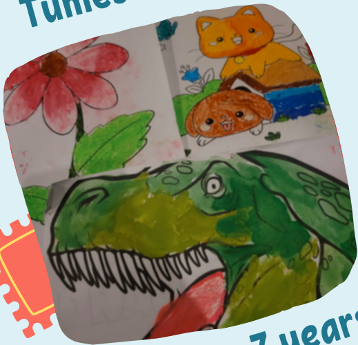
Purvansh - 7 years