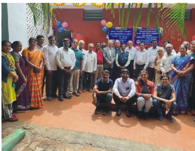
Inauguration of Comfort Station At GHS Vijayapura.