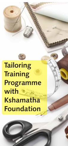
Tailoring Training Programme with Kshamatha Foundation