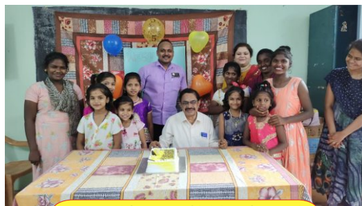
BIRTHDAY CELEBRATION WITH CHILDREN