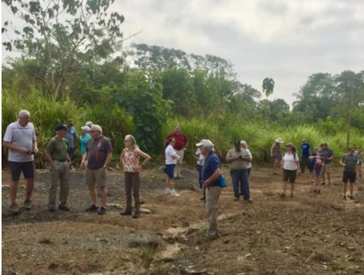
Rotarians from Montana on a tour of a completed water project in Guatemala.