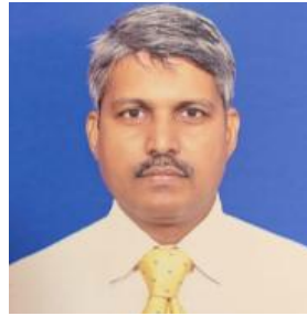
A message from the Editor