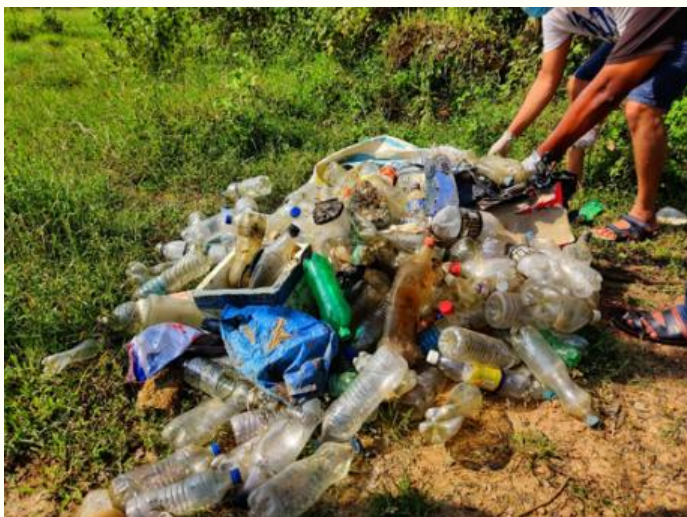
Clockwise from the top : Rotary club members & Volunteers after hours of a successful cleanup; A pile of refuse collected by the volunteers during cleanup