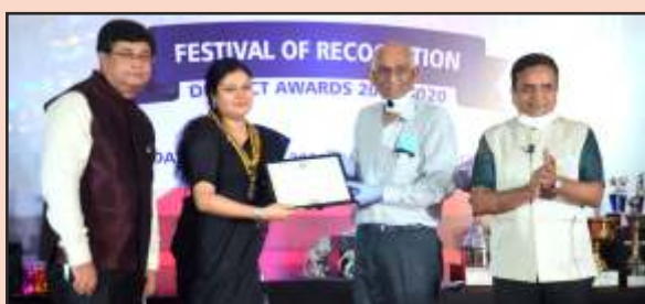
Rotary Club of Kolkata Millenium