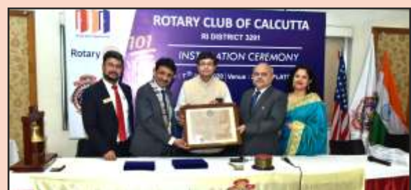
Rotary Club of Calcutta