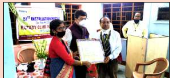
Rotary Club of Kamarhati