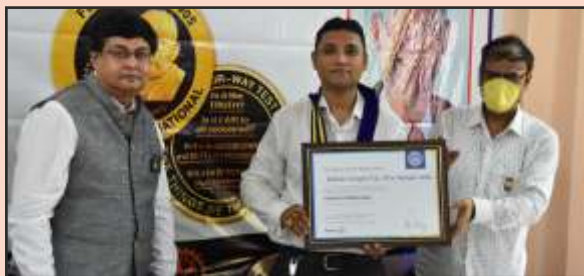
Rotary Club of Kolkata Temple City