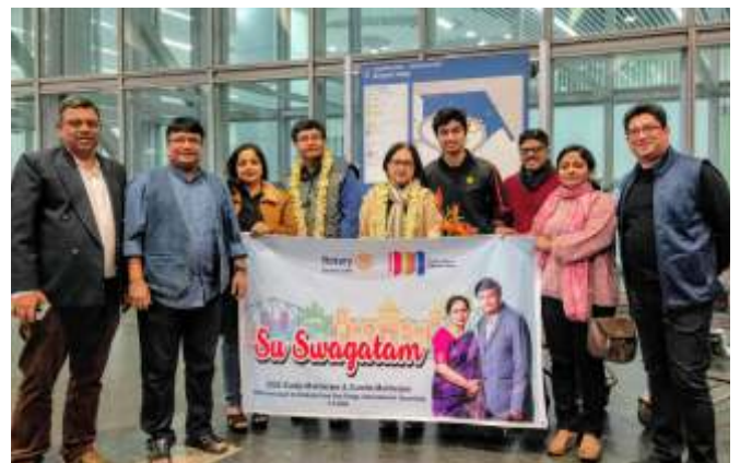
Welcome back for Governor Elect