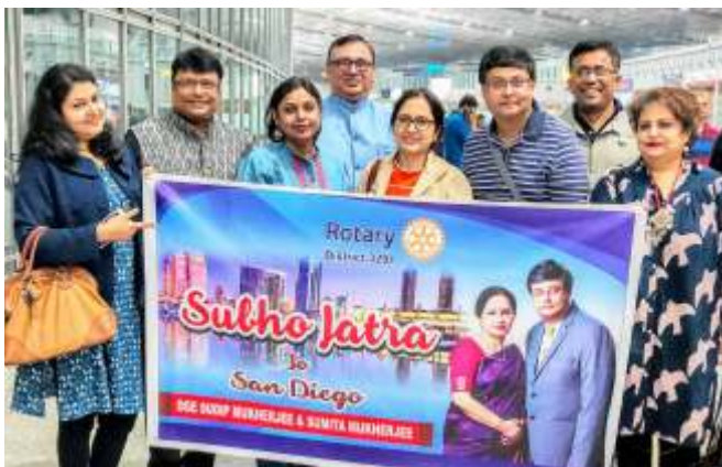
Bon Voyage at the airport