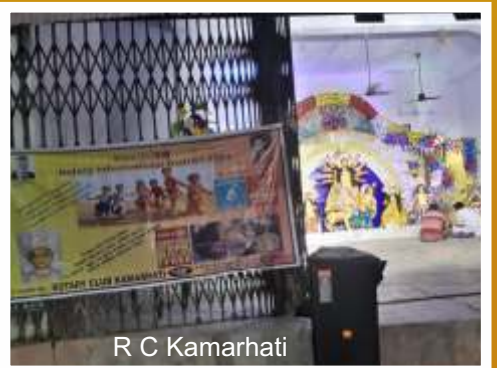
R C Kamarhati