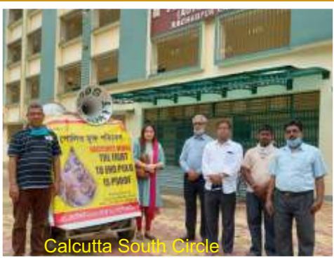
Calcutta South Circle