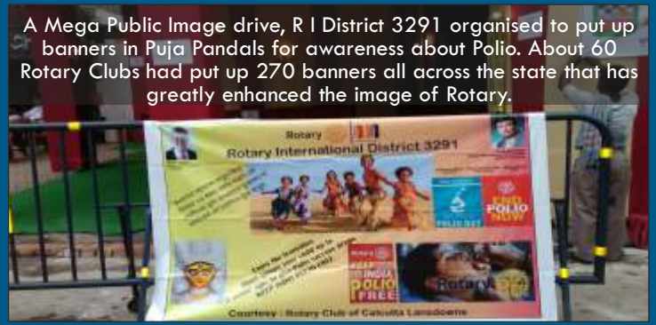
Rotary Club of Lansdowne