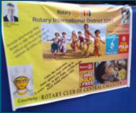
Rotary Club of Central Calcutta