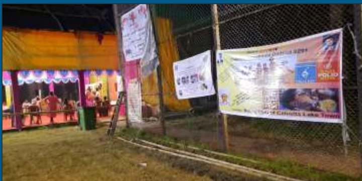
Rotary club of Calcutta Laketown