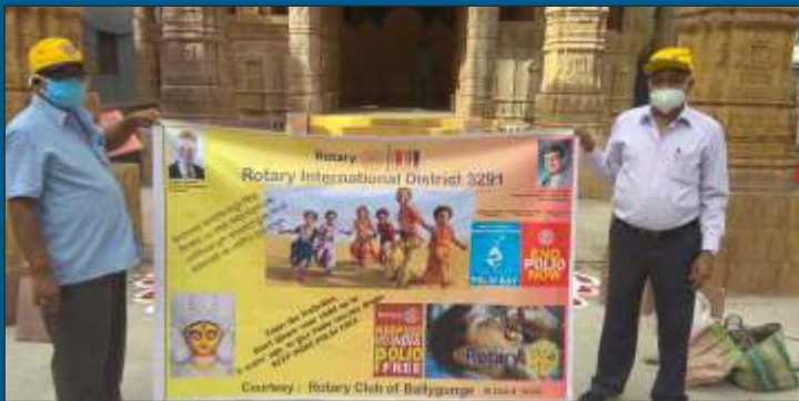
Rotary Club of Ballygunge