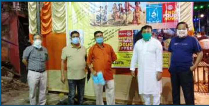
Rotary Club of East Calcutta