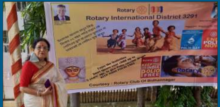
Rotary Club of Bidhannagar