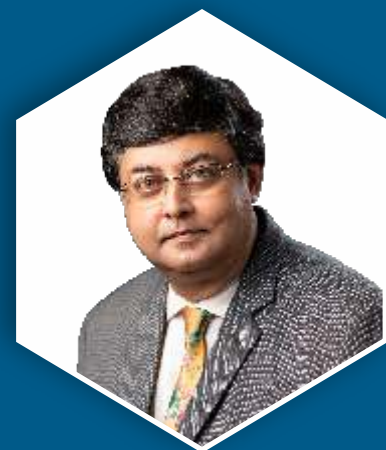
District Governor Sudip Mukherjee