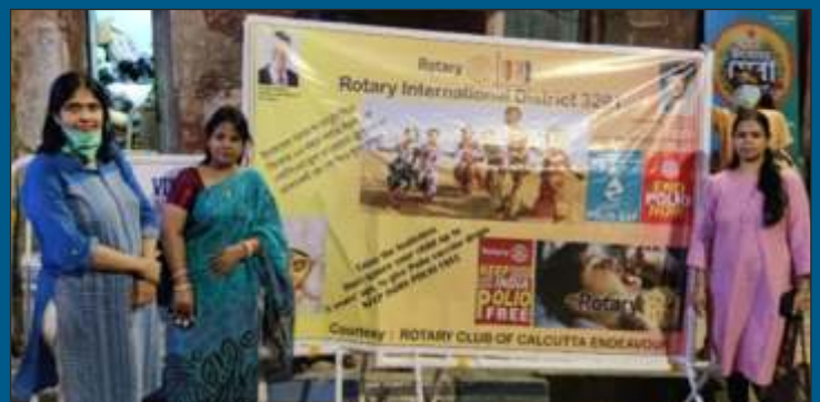
Rotary Club of Calcutta Endeavour