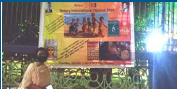
Rotary Club of New Ballygunge