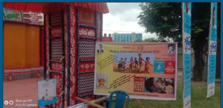
Rotary Club of Calcutta Visionaries

A Mega Public Image drive, R I District 3291 organised to put up banners in Puja Pandals for awareness about Polio. About 60 Rotary Clubs had put up 270 banners all across the state that has greatly enhanced the image of Rotary.