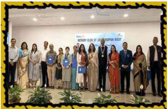
RC JSR West