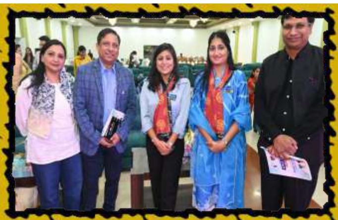
RC Chanakya Pride