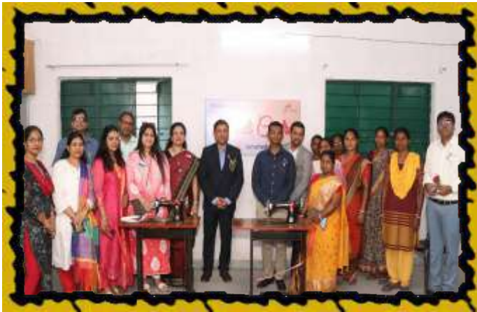
RC JSR Dalma : Inauguration of Saheli Center