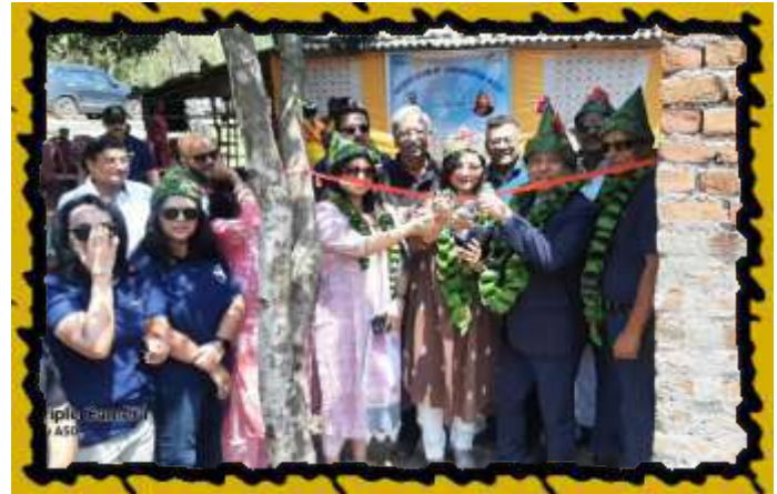
RC JSR West