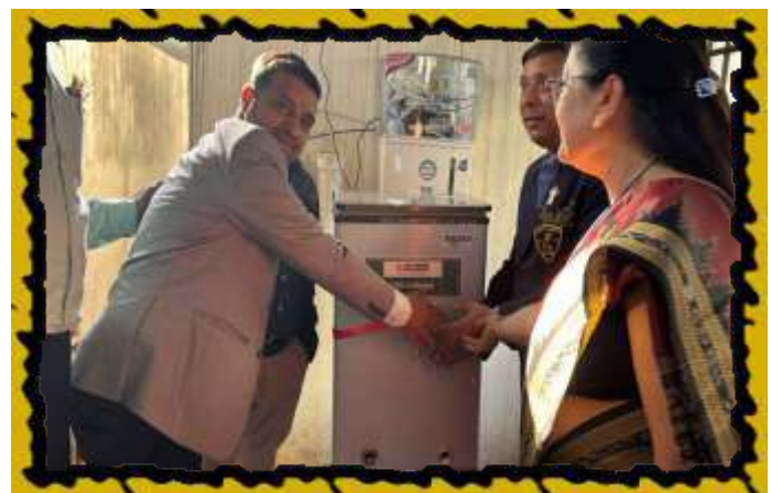
RC JSR Dalma