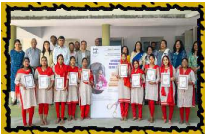
RC JSR East