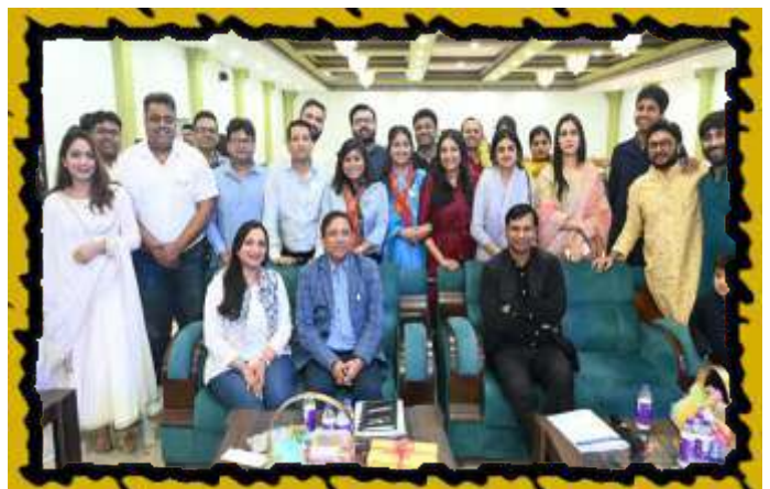
RC Chanakya Pride