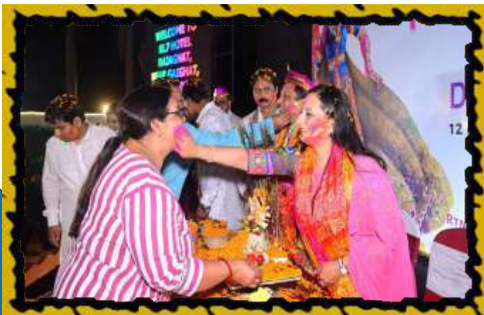
Holi Milan Program of RC Patna City Samrat