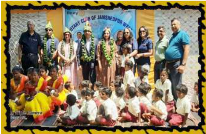
RC JSR West