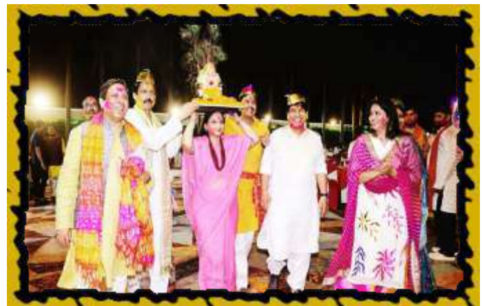
Holi Milan Program of RC Patna City Samrat