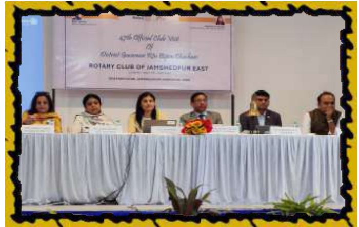
RC JSR East