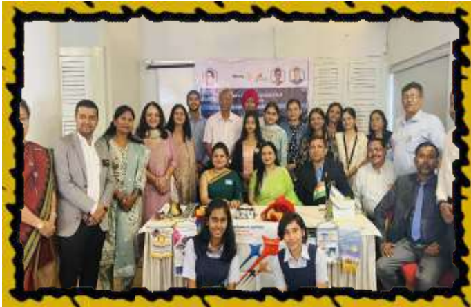
RC JSR Midtown