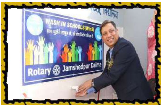
RC JSR Dalma