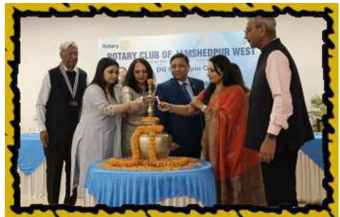
RC JSR West