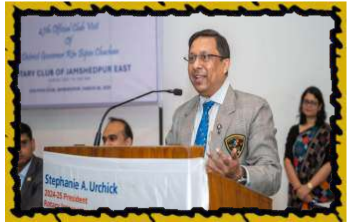
RC JSR East