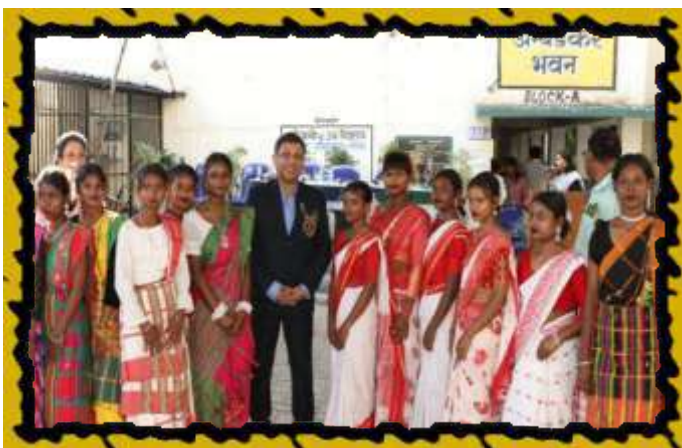
RC JSR Dalma