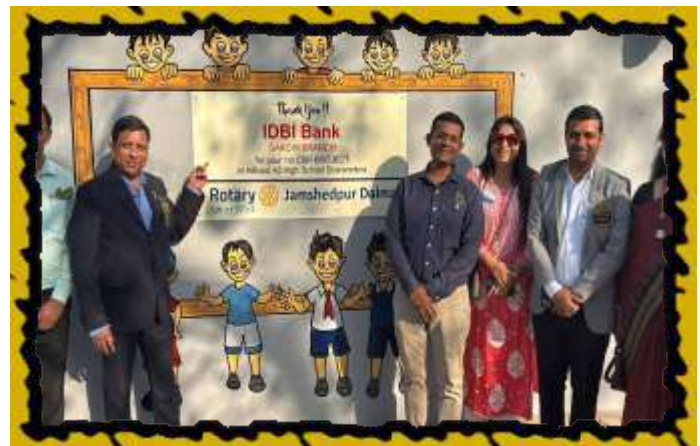
RC JSR Dalma