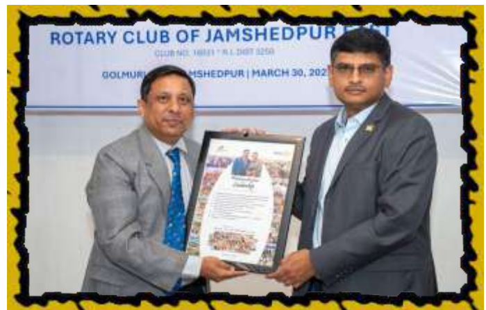
RC JSR East