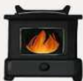
Bogas Cook Stove