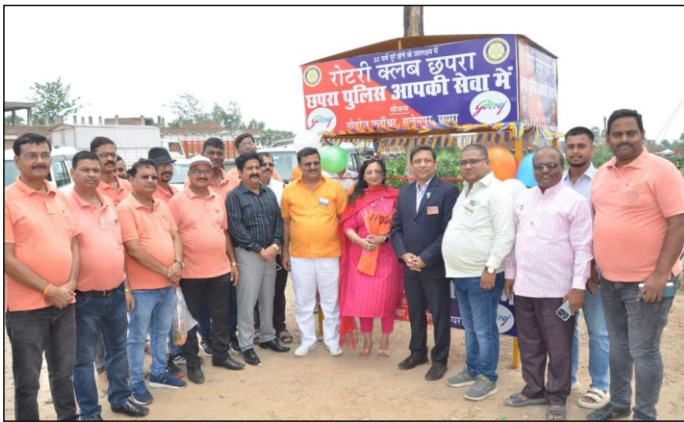
Rotary Club of Chapra