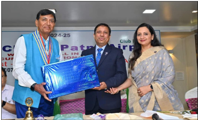
Rotary Club of Patna Airport