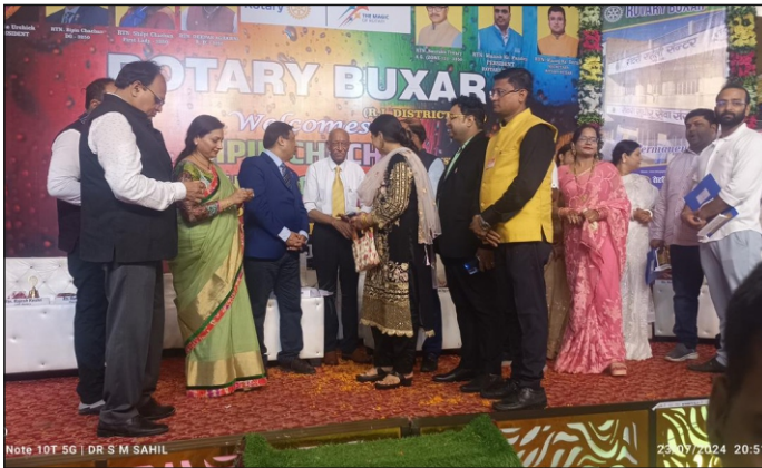
Rotary Club of Buxar