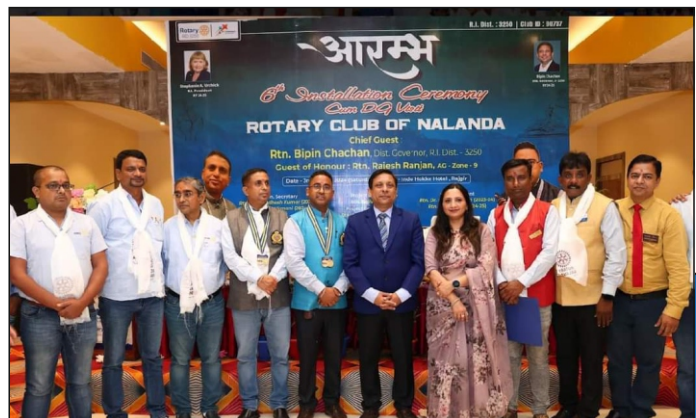
Rotary Club of Nalanda