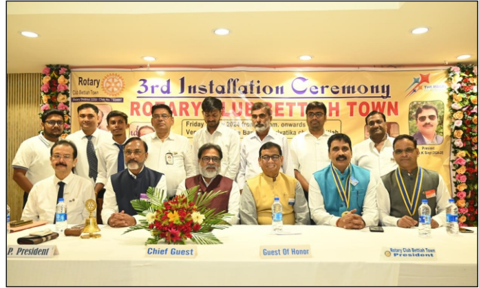
Rotary Club of Bettiah Town