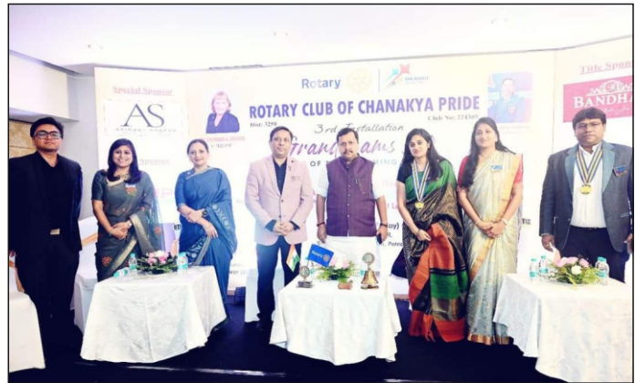
Rotary Club of Chanakya Pride