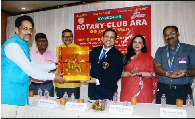
Rotary Club of Ara