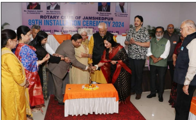
Rotary Club of Jamshedpur