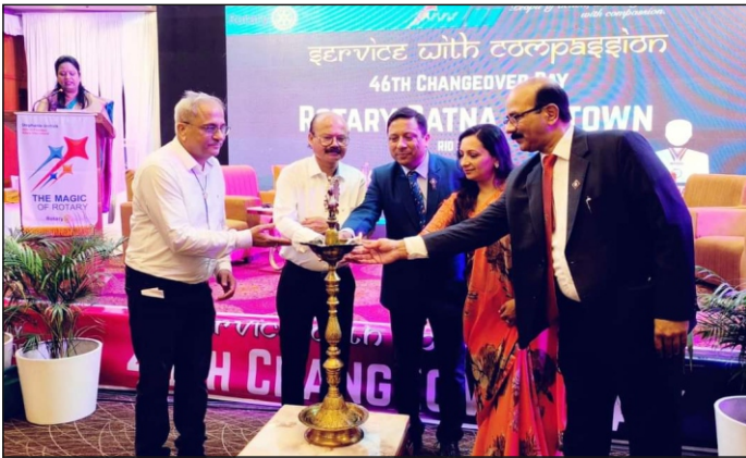
Rotary Club of Patna Midtown