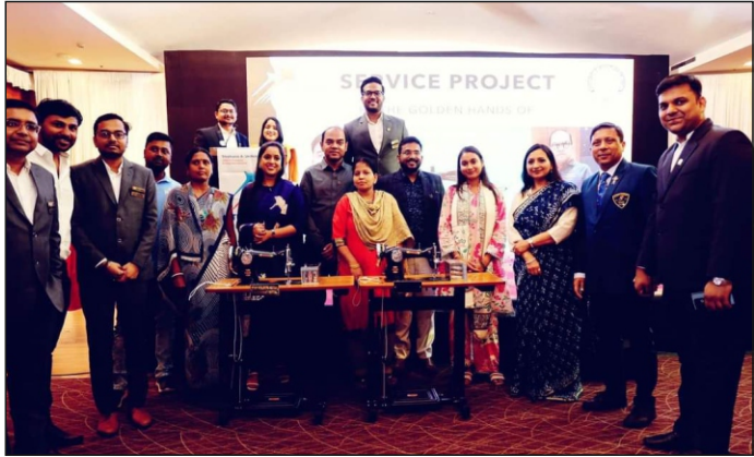
Rotary Club of Pataliputra Nextgen