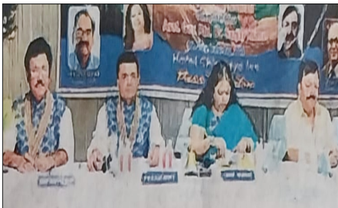
Rotary Club of Bhagalpur