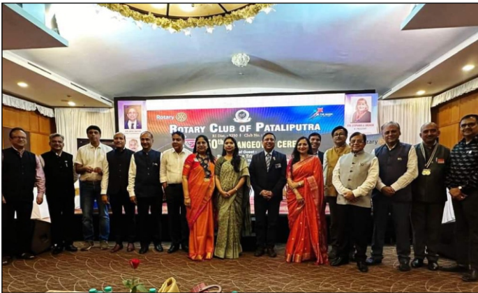
Rotary Club of Pataliputra