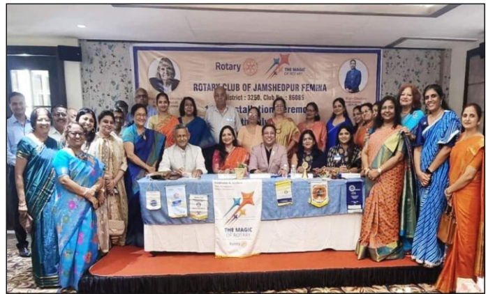
Rotary Club of Jamshedpur Femina