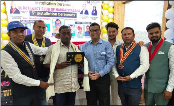
Rotary Club of Narkatiyaganj