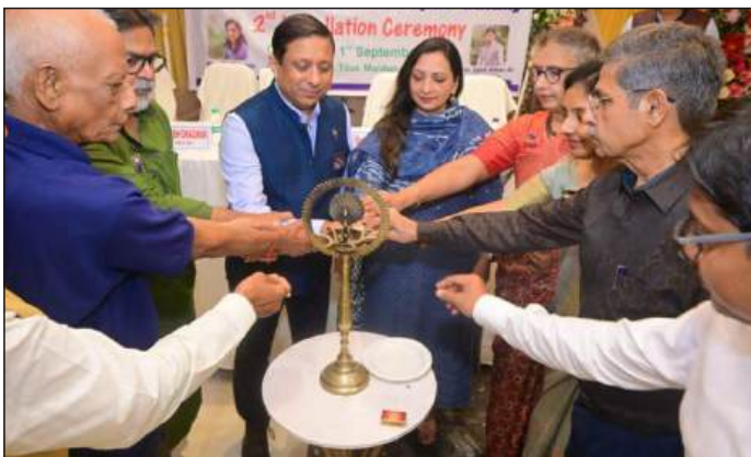
RC MUZAFFARPUR GALAXY