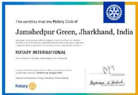
RC Jamshedpur Green