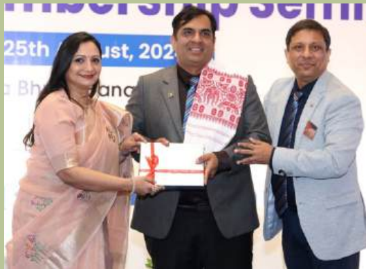
From RID 3191