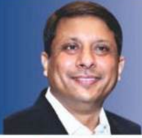
Bipin Chachan District Governor