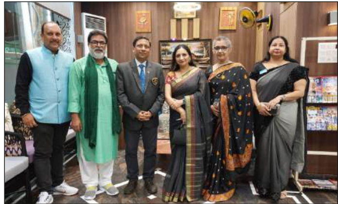
RC MUZAFFARPUR LICHHAVI