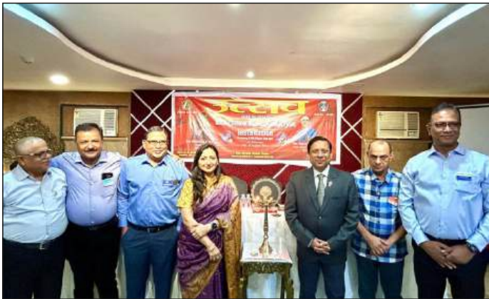
RC DARBHANGA MIDTOWN