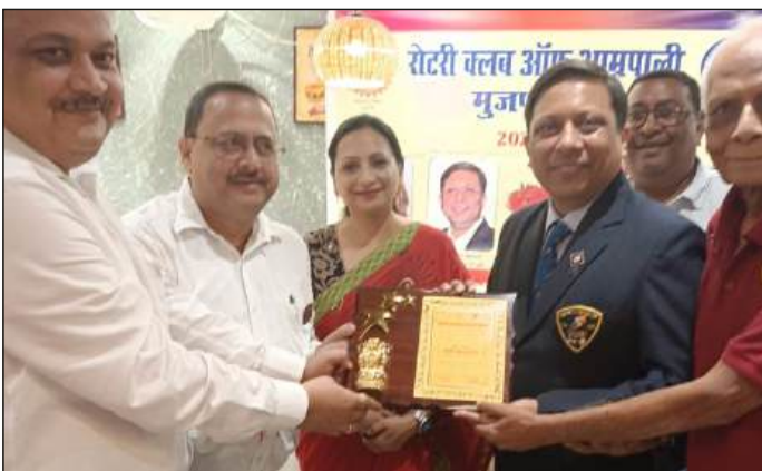
RC AMRAPALI MUZAFFARPUR