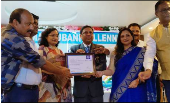
CHARTER PRESENTATION - RC MADHUBANI MILLENNIUM