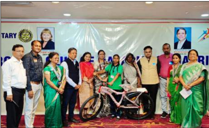
RC HAZARIBAGH JAGRITI