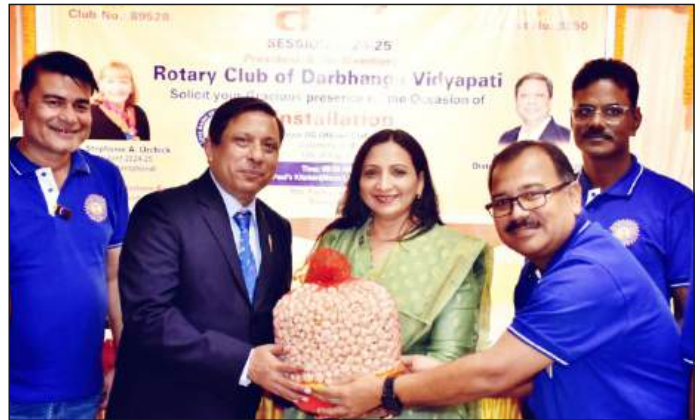
RC DARBHANGA VIDHYAPATI