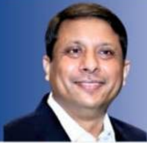
Bipin Chachan District Governor