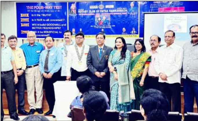
RC PATNA KANKARBAGH