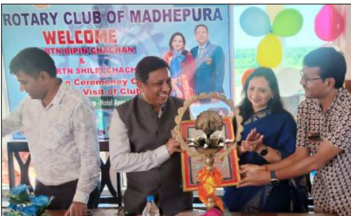
RC MADHEPURA AND SUPAUL JOINTLY