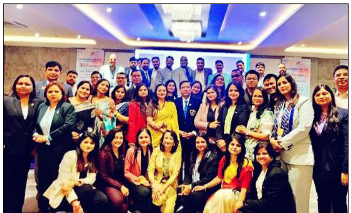
RC GAYA YUVA