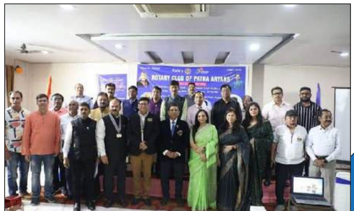
RC PATNA ARYANS