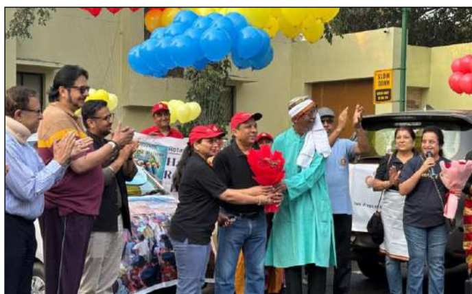
Car Rally - All Clubs of Jamshedpur