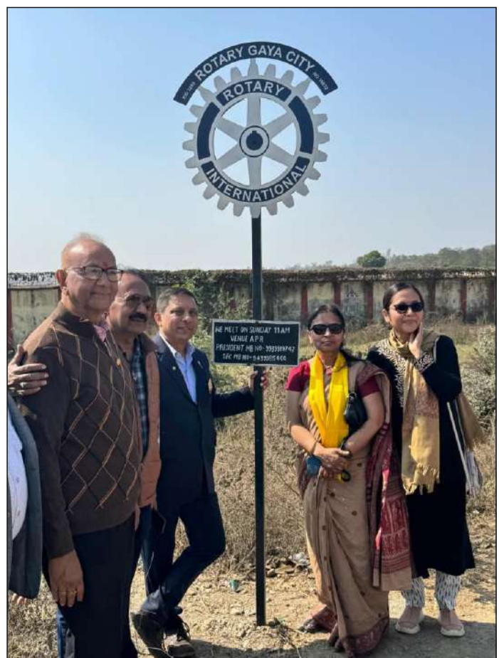
RC Gaya City