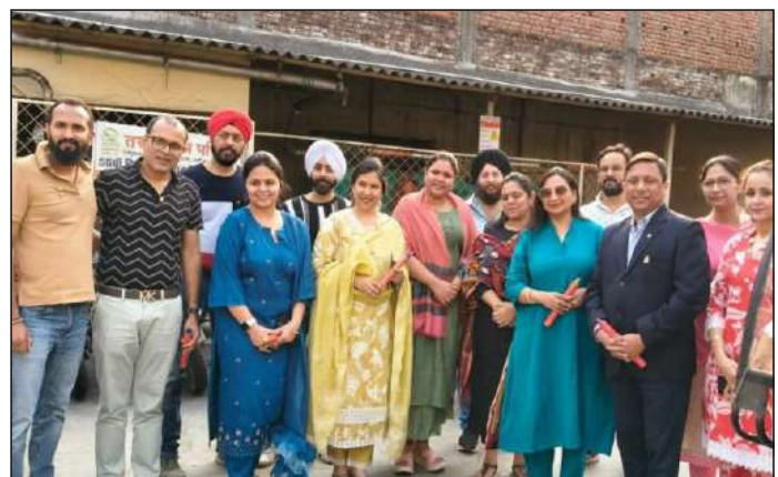
RC Giridih Couple