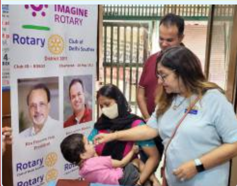
Rotary Club of Delhi Southex