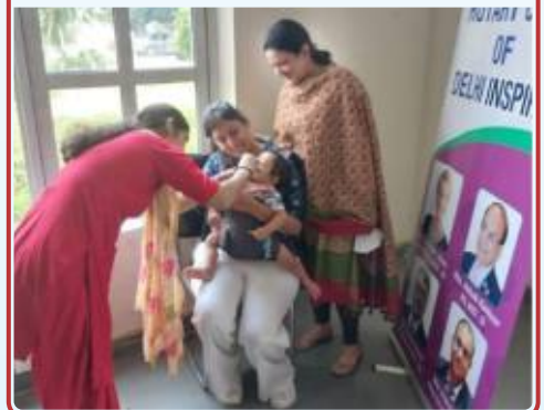
Rotary Club of Delhi Inspire