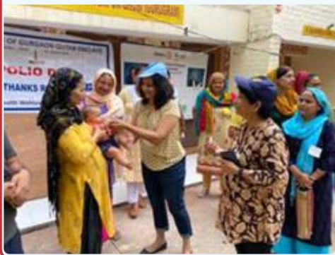
Rotary Club of Gurgaon Qutab Enclave