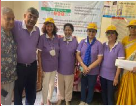
Rotary Club of Delhi Central