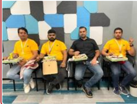
Rotary Club of Gurgaon Cosmopolitan