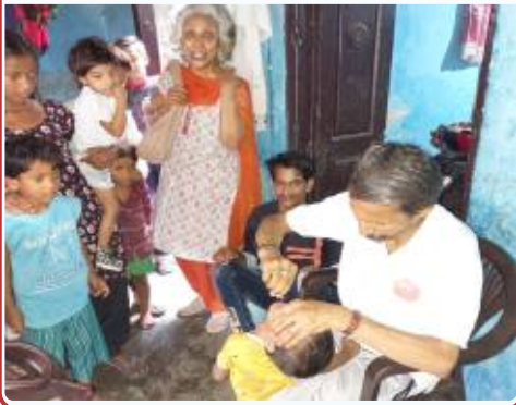
Rotary Club of Indraprastha Okhla