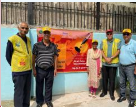
Rotary Club of Delhi