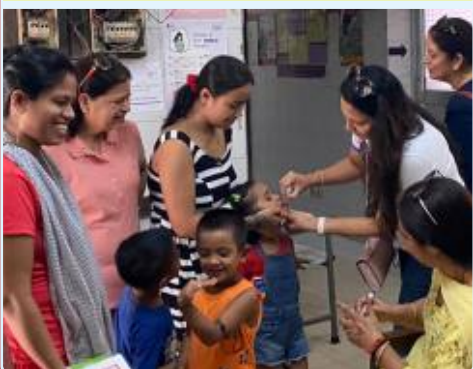
Rotary Club of Delhi Khubsurat