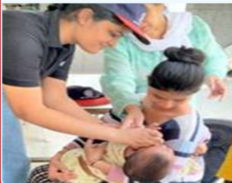
Rotary Club of Delhi Panchshila Park