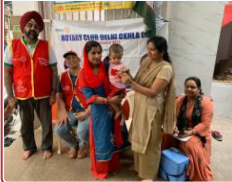
Rotary Club of Delhi Okhla City