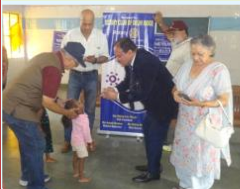
Rotary Club of Delhi Ridge