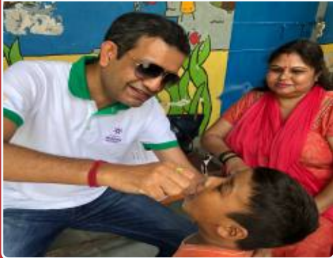
Rotary Club of Delhi Millenium