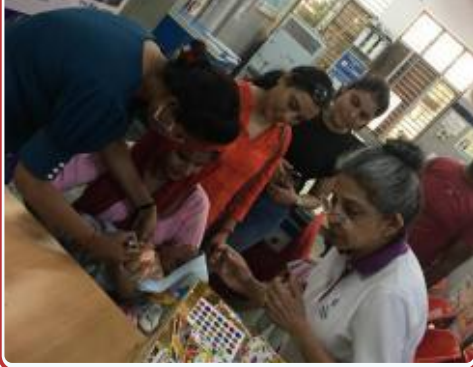
Rotary Club of Delhi Resources