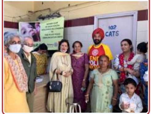
Rotary Club of Delhi South