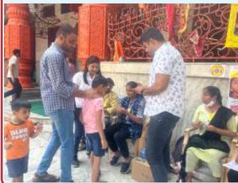
Rotary Club of Faridabad N.I.T Next