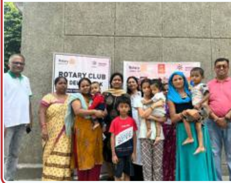
Rotary Club of Delhi Janak