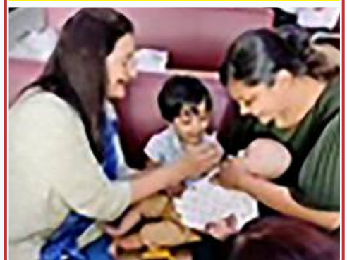
Rotary Club of Delhi Safdarjung