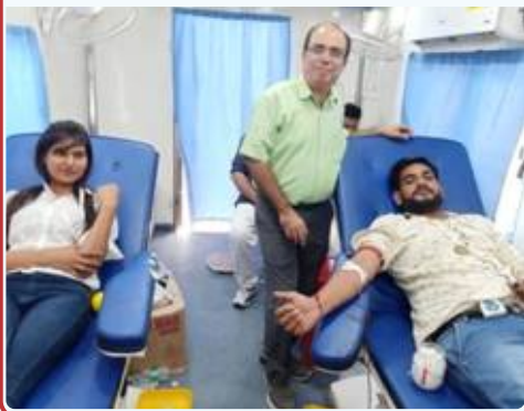
Rotary Club of Faridabad Aravalli