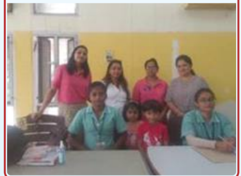
Rotary Club of Faridabad Arth