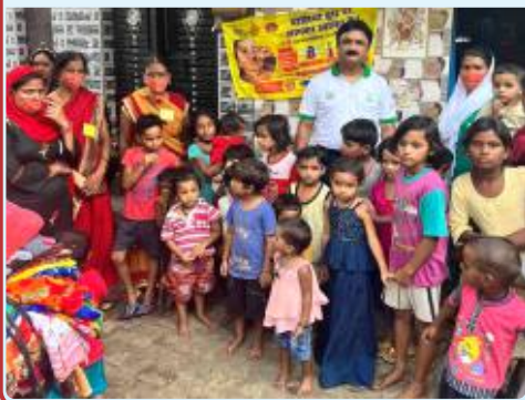
Rotary Club of Faridabad N.I.T