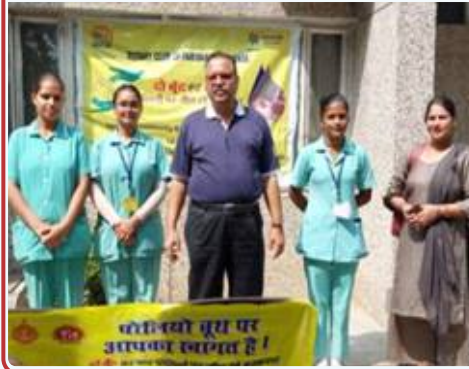
Rotary Club of Faridabad Heritage