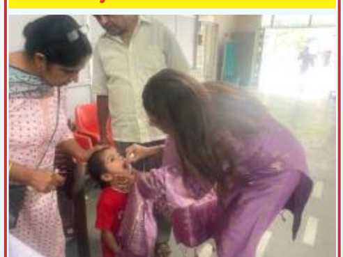
Rotary Club of Delhi Delhiites