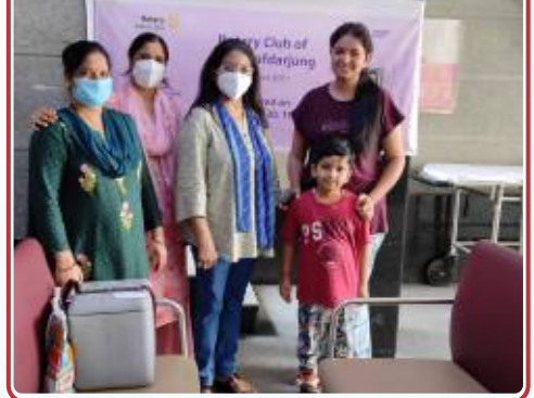
Rotary Club of Delhi Safdarjung