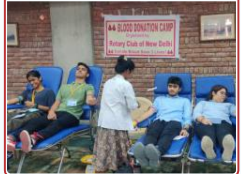
Rotary Club Of New Delhi