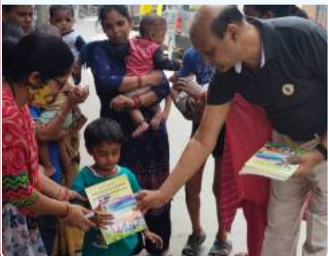
Rotary Club of Delhi Divine