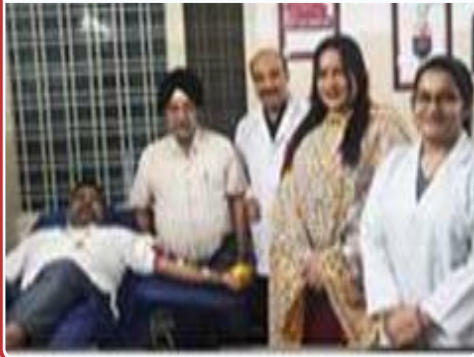
Rotary Club of Gurgaon South City