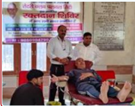
Rotary Club of Palwal City