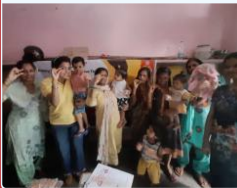
Rotary E-Club of Progressive Thinkers