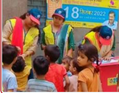
Rotary Club of Delhi West