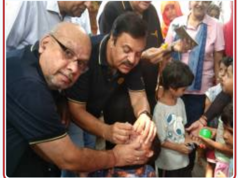
Rotary Clubs of Faridabad Elite, East & Central