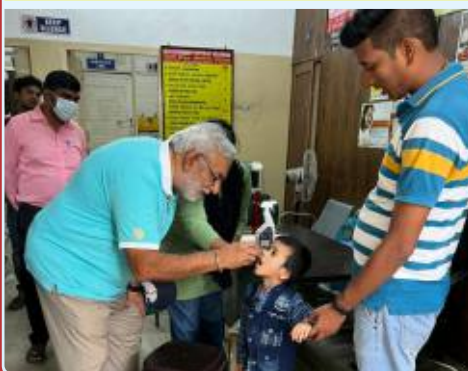
Rotary Club of Delhi South East