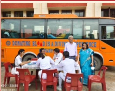
Rotary Club of Delhi Heights