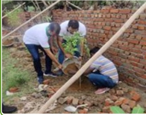
Rotary Club of Faridabad Greater