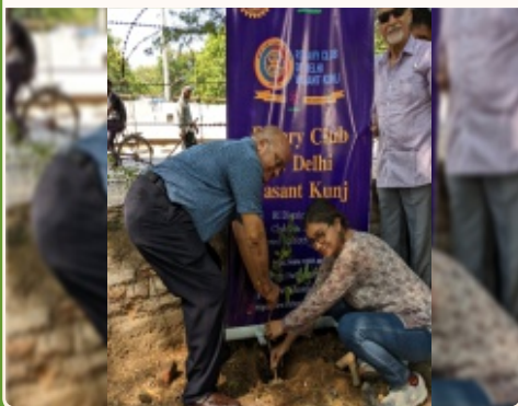
Rotary Club of Delhi Vasant Kunj