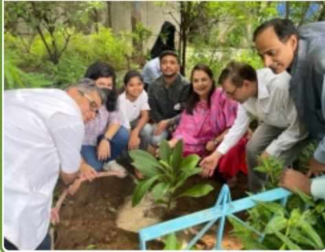
Rotary Club of New Delhi