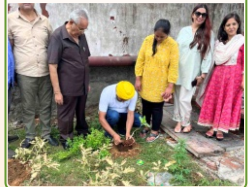
Rotary Club of Faridabad N.I.T