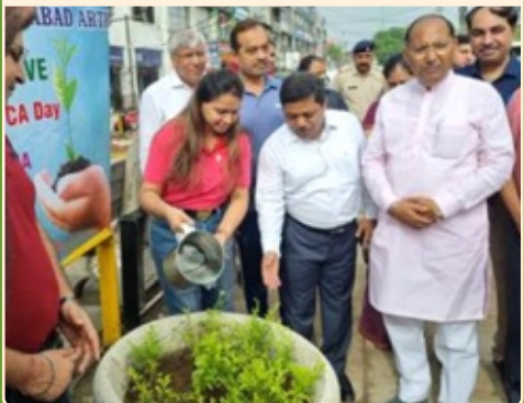
Rotary Club of Faridabad Arth