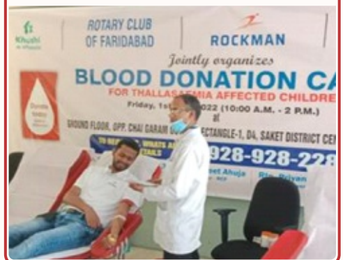
Rotary Club of Faridabad