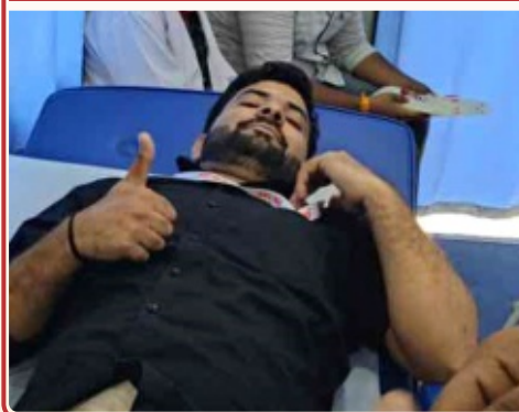
Rotary Club of Faridabad Smart City