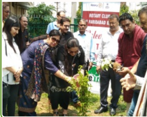
Rotary Club of Faridabad East