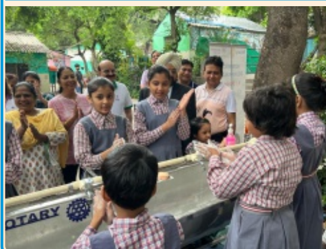
Rotary Club of Delhi Okhla City