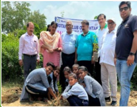
Rotary Club of Rohtak