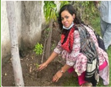
Rotary Club of Delhi Femina