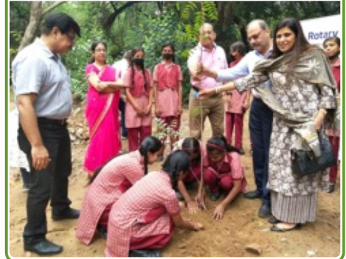
Rotary Club of Delhi Panchshila Park