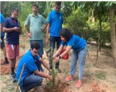
Rotary Club of Delhi Millennium