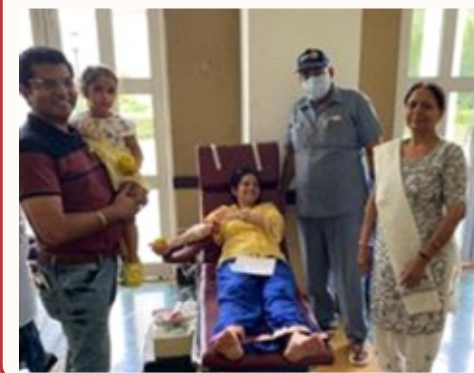
Rotary Club of New Gurgaon