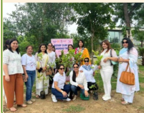
Rotary Club of Faridabad Tulips