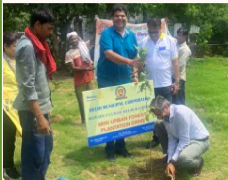
Rotary Club of Delhi Rajdhani