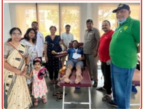
Rotary Club of New Gurgaon