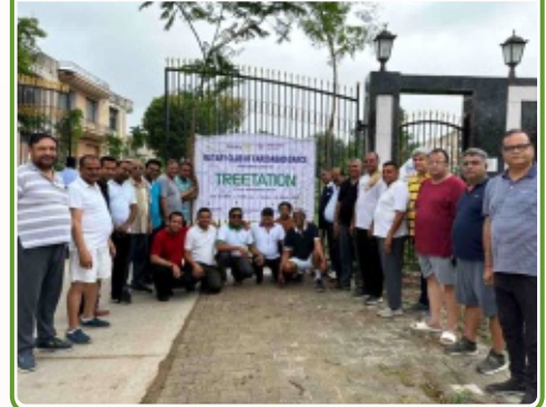
Rotary Club of Faridabad Grace