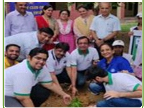
Rotary Club of Faridabad Greater Next