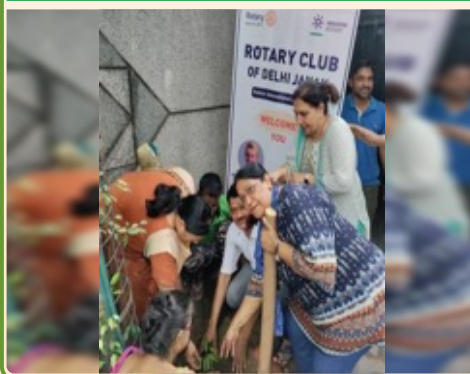
Rotary Club of Delhi Janak