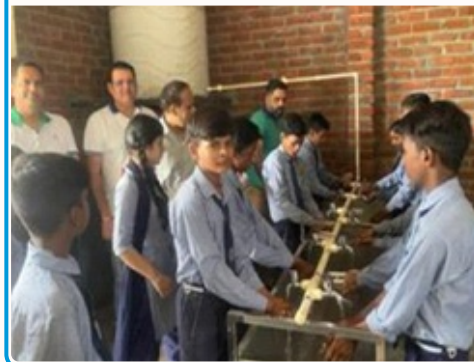
All Rotary Clubs of Zone - 24