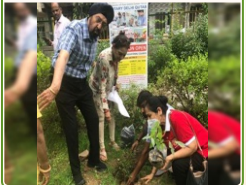
Rotary Club of Delhi Qutub