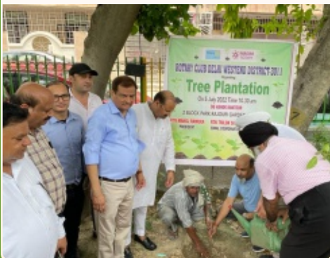
Rotary Club of Delhi Westend