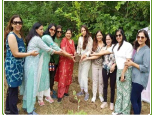
Rotary Club of Delhi Khubsurat