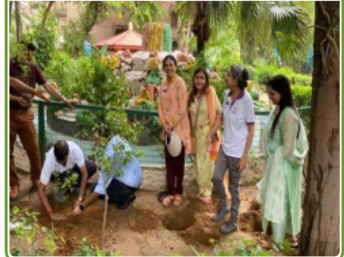
Rotary Club of Delhi Southex