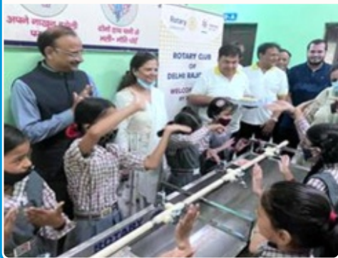
Rotary Club of Delhi Rajdhani