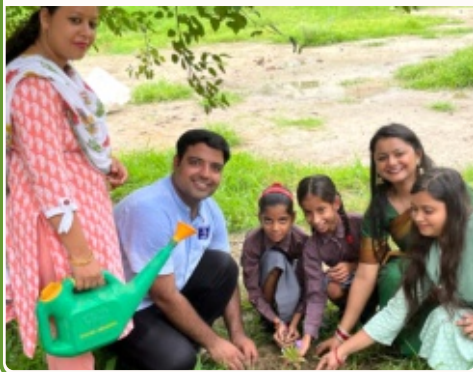
Rotary Club of Delhi Shine