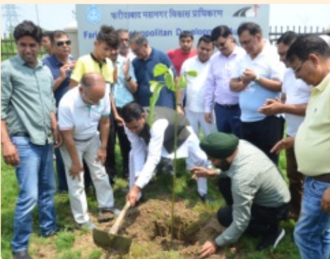
Rotary Club of Faridabad Central