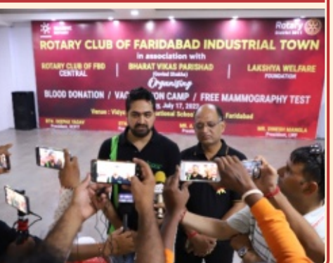
Rotary Club of Faridabad Industrial Town