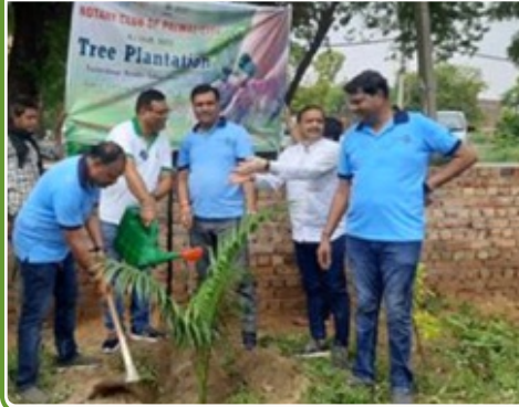
Rotary Club of Palwal City