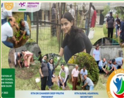
Rotary Club of Delhi Divine