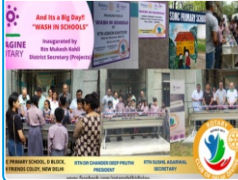
Rotary Club of Delhi Divine