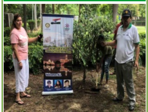
Rotary Club of Delhi Connaught Place Raisina Hills