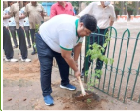
Rotary Club of Delhi Central Next