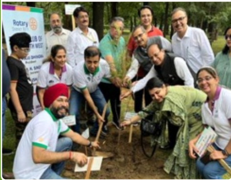
Rotary Club of Delhi South West