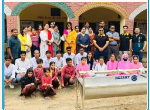
All Rotary Clubs of Zone - 19