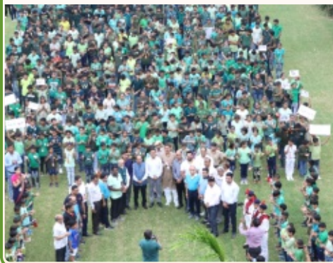
Rotary Club of Faridabad Industrial Town