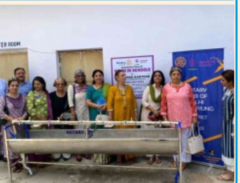
Rotary Club of Delhi Safdarjung