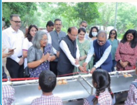
Rotary Club of Delhi West