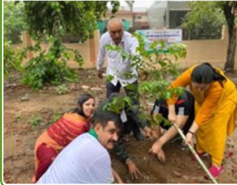
Rotary Club of Rewari Royals