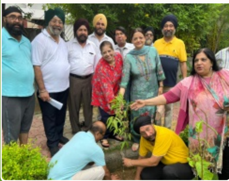
Rotary Club of Cosmopolitan Greater