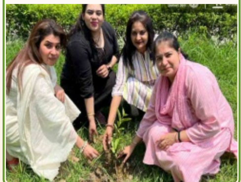
Rotary Club of Delhi Safdarjung