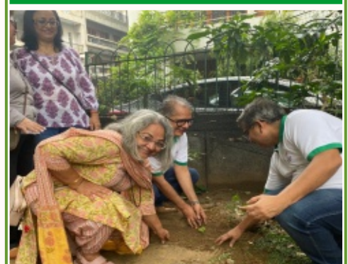
Rotary Club of Delhi West