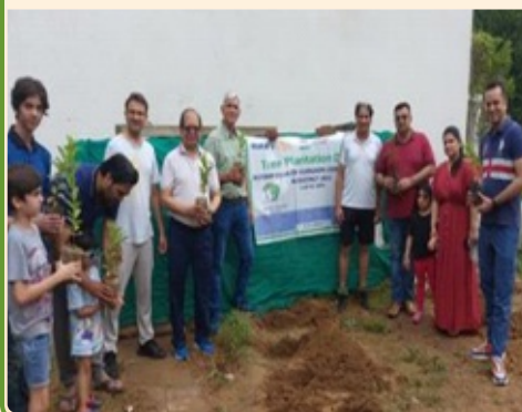
Rotary Club of Gurgaon Cosmopolitan