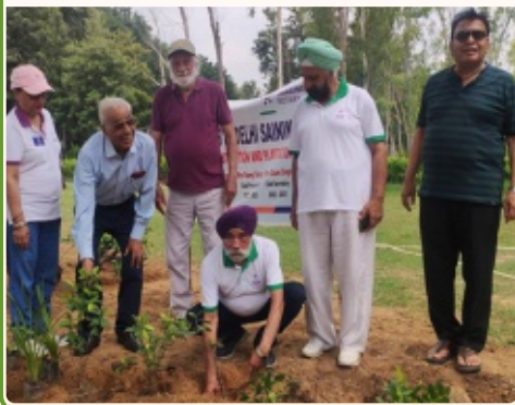
Rotary Club of Delhi Sainik Farms