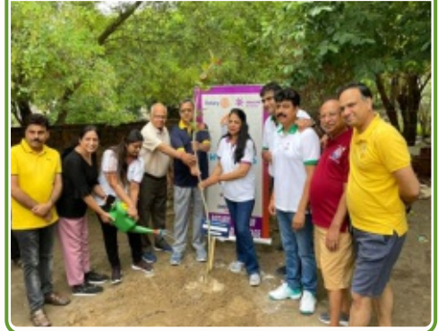
Rotary Club of Faridabad Heritage