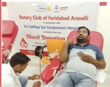
Rotary Club of Faridabad Aravalli