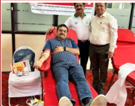
Rotary Club of Faridabad N.I.T