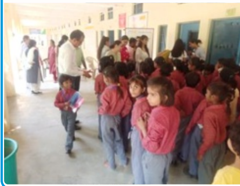
Rotary Club of Delhi Panchshila Park