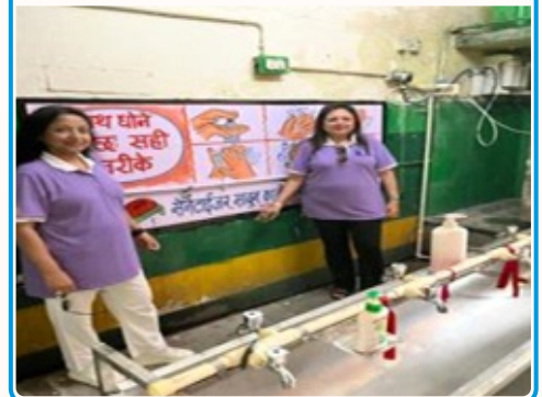
Rotary Club of Delhi Central