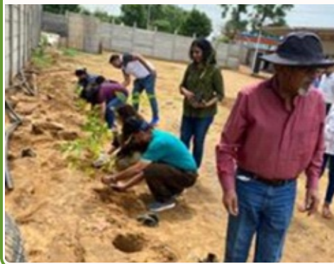
Rotary Club of Gurgaon Qutab Enclave