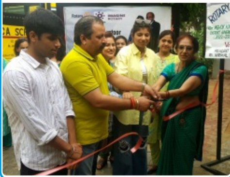
Rotary Club of Gurgaon Pravahini