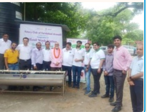
All Rotary Clubs of Zone - 20