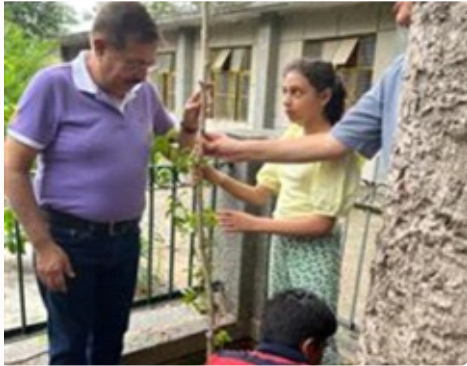
Rotary Club of Delhi Central