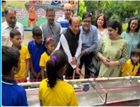
Rotary Club of Delhi South Central