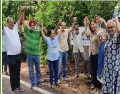
Rotary Club of Indraprastha Okhla