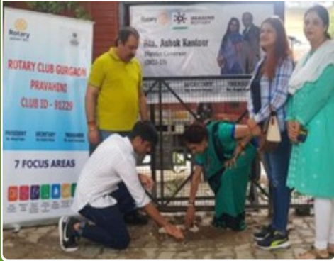
Rotary Club of Gurgaon Pravahini