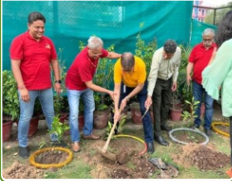
Rotary Club of Gurgaon