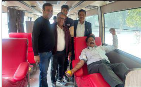
Rotary Club of Delhi South West