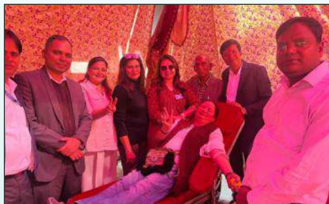
Rotary Club of Faridabad Tulips