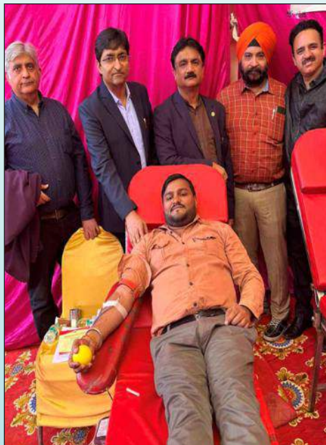
Rotary Club of Faridabad N.I.T