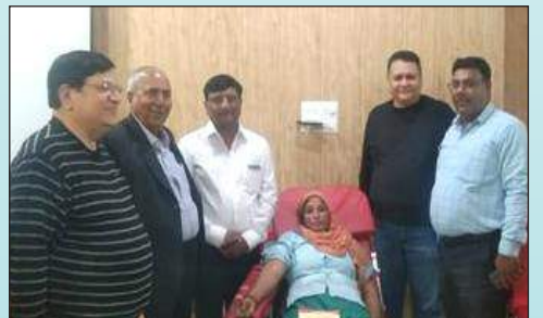
Rotary Club of Faridabad East