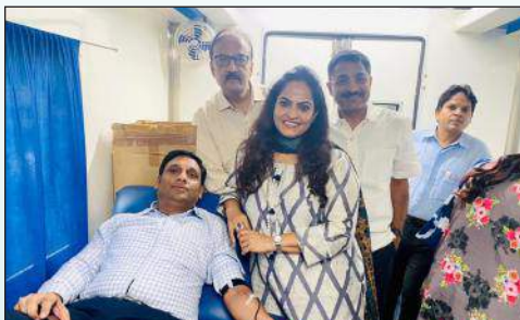
Rotary Club of Delhi Rajdhani