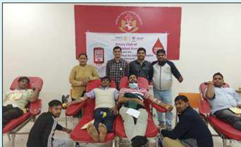
Rotary Club of Faridabad Aravalli