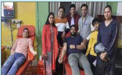
Rotary Club of Faridabad Arth