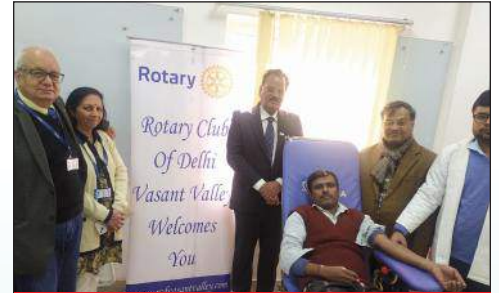
Rotary Club of Delhi Vasant Valley