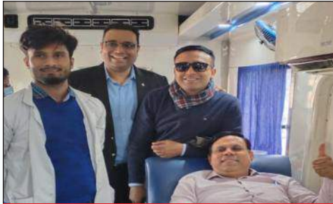
Rotary Club of Delhi Okhla City