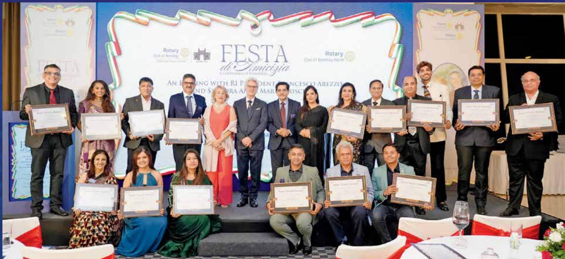
Rotarian business leaders proudly receive their Rotary Verified Business (RVB) certifications during the landmark launch ceremony in Mumbai.