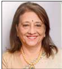
Nargis Gaur Vocational Awards